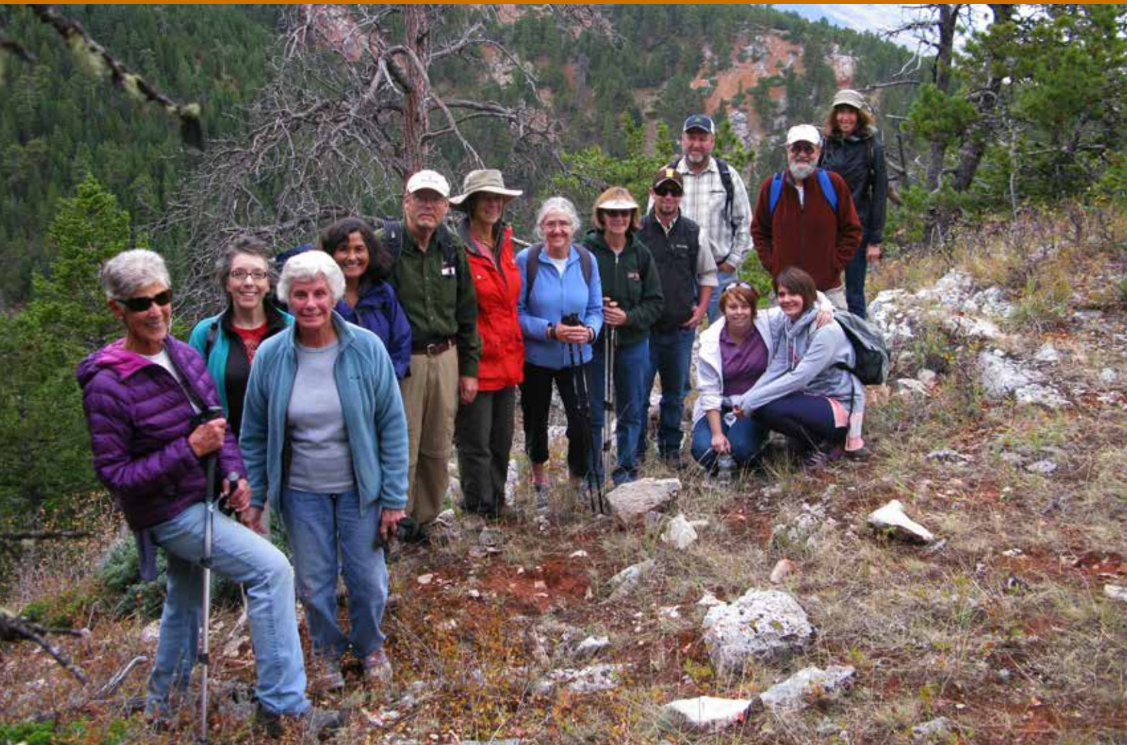
Hikers pause for a breather at a scenic overlook during SCLT's Public Lands Day outing along a proposed trail in the Red Grade vicinity.