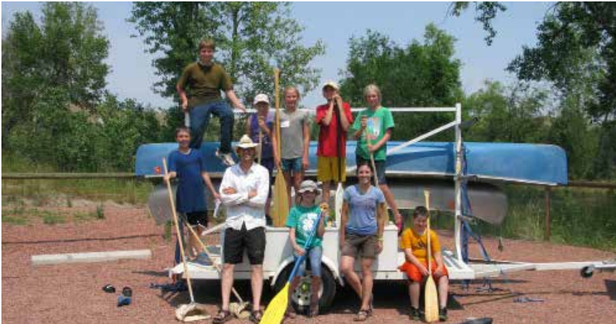
The group after our "Paddle Power" class at Kleenburn Recreation Area.

Our Explorer Series, in partnership with Science Kids, challenges local kids to get outside in the name of health, recreation, and conservation stewardship. This past summer SCLT offered monthly outings that highlighted the ranching heritage, rich history, and recreation opportunities in Sheridan County. To view next year's classes and enroll your child, please visit www.science-kids.org .