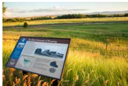
The Kooi townsite along the Black Diamond Byway.