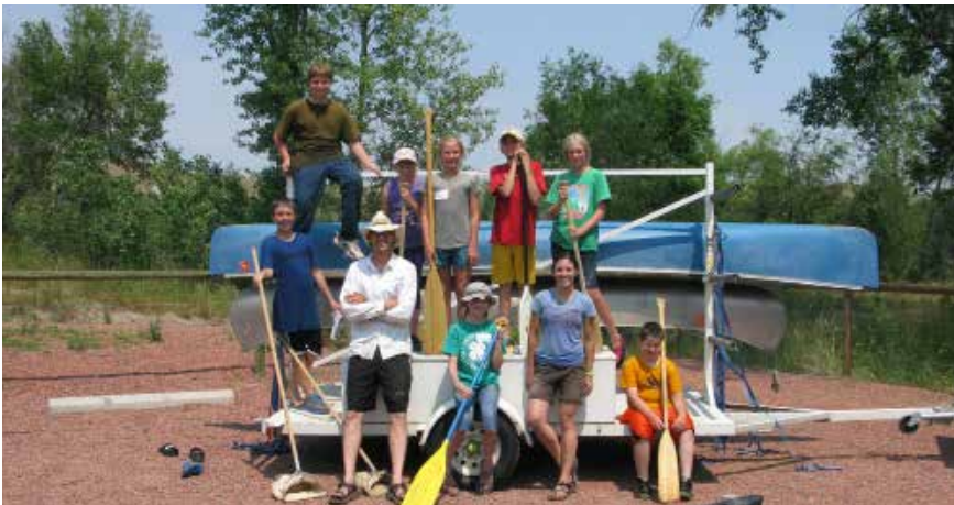
The group after our "Paddle Power" class at Kleenburn Recreation Area.

Our Explorer Series, in partnership with Science Kids, challenges local kids to get outside in the name of health, recreation, and conservation stewardship. This past summer SCLT offered monthly outings that highlighted the ranching heritage, rich history, and recreation opportunities in Sheridan County. To view next year's classes and enroll your child, please visit www.science-kids.org .