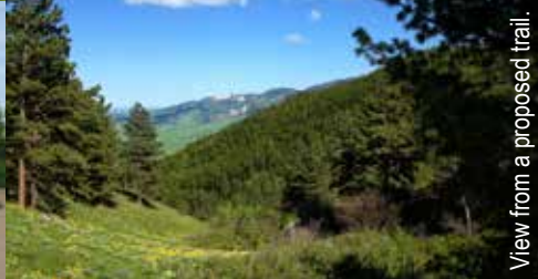
View from a proposed trail.