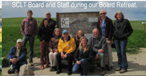
SCLT Board and Staff during our Board Retreat.