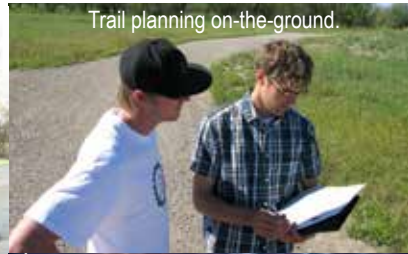
Trail planning on-the-ground.