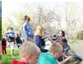
View from a proposed trail.