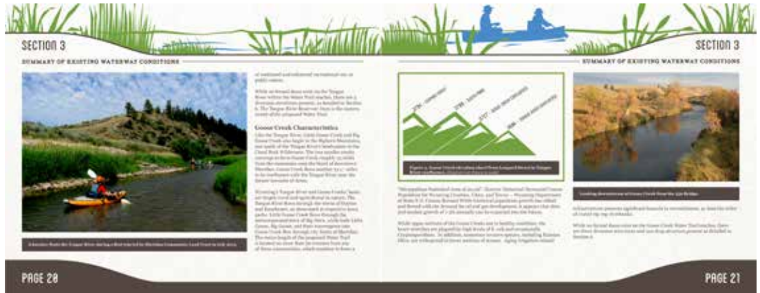
Excerpt from Section 3 of the assessment detailing current water conditions and elevation.

P.O. Box 7185 52 S. Main St., Suite 1 Sheridan, WY 82801 (307) 673 - 4702 sheridanclt.org