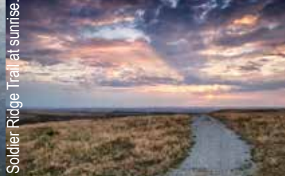
Soldier Ridge Trail at sunrise.