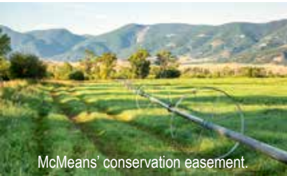
McMeans' conservation easement.