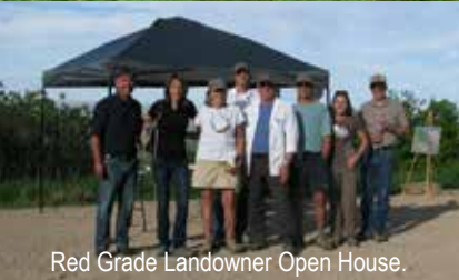
Red Grade Landowner Open House.