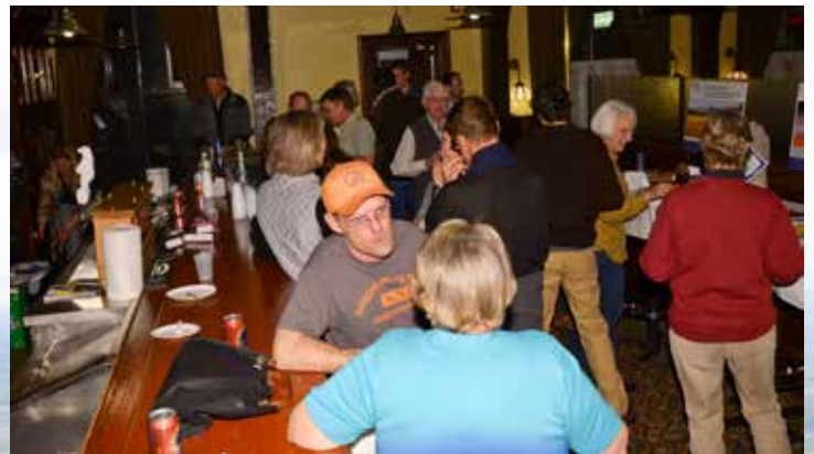
The crowd enjoying last year's Open House at the Sheridan Inn.

Join us after work for appetizers, drinks, and good company! We'll have some unique raffle prizes you won't want to miss - from local farm fare to fishing and other guided outdoor trips. You'll also get the inside scoop on 2015 projects. Hope to see you all there!