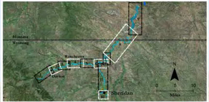
Extent map of the Tongue River Water Trail, excerpted from the TRWT Assessment, available to the public on our website at www.sheridanclt.org .

My goal was to replace a barbed wire cattle fence that spanned the river, hazardous to boaters and a maintenance issue for livestock operators. The Sheridan Community Land Trust provided funding to build a steel cable-and PVC fence that