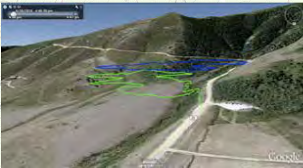
3-D rendering of Phase I of Red Grade Trails, two looping trails on State Land to be completed this summer.

Thanks to your generous support and a $50,000 grant awarded by the Wyoming State Parks & Cultural Resources' Recreational Trails Program (RTP), SCLT anticipates completing the first two miles of trail for the Red Grade Trails System by September! We are currently advertising for bids from qualified trail contractors and plan to award a bid in May for construction this summer.