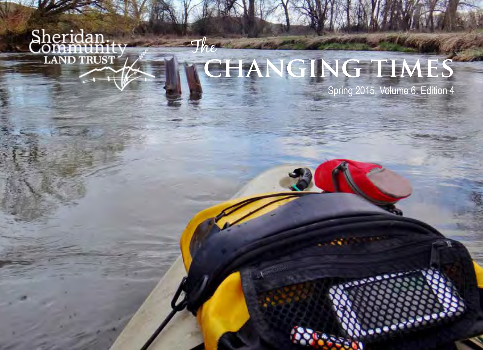
Metal beams protrude from the water on the Tongue River ahead of an SCLT volunteer's kayak.