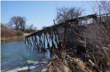
This 90 ft. section of conveyor track was removed from the Tongue River on April 13 th .

With permission from landowners, we spent four hours cleaning trash along the streambed and riverbanks. It was a great way to see firsthand the work that needs to be done to make our waterways safer and more enjoyable for public recreation.