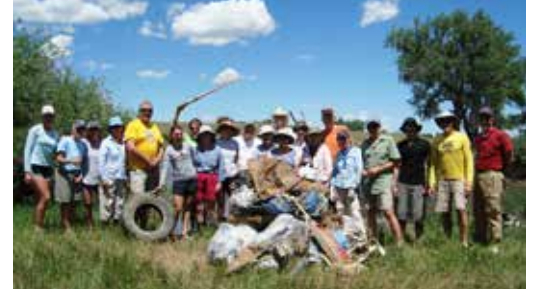
Tongue Riverpalooza volunteers with their debris pile after our float and river clean-up on July 11 th .

On Saturday, July 11 th , 20 volunteers joined us for Tongue Riverpalooza, sponsored by American Rivers, to clean up trash along Goose Creek and Tongue River.