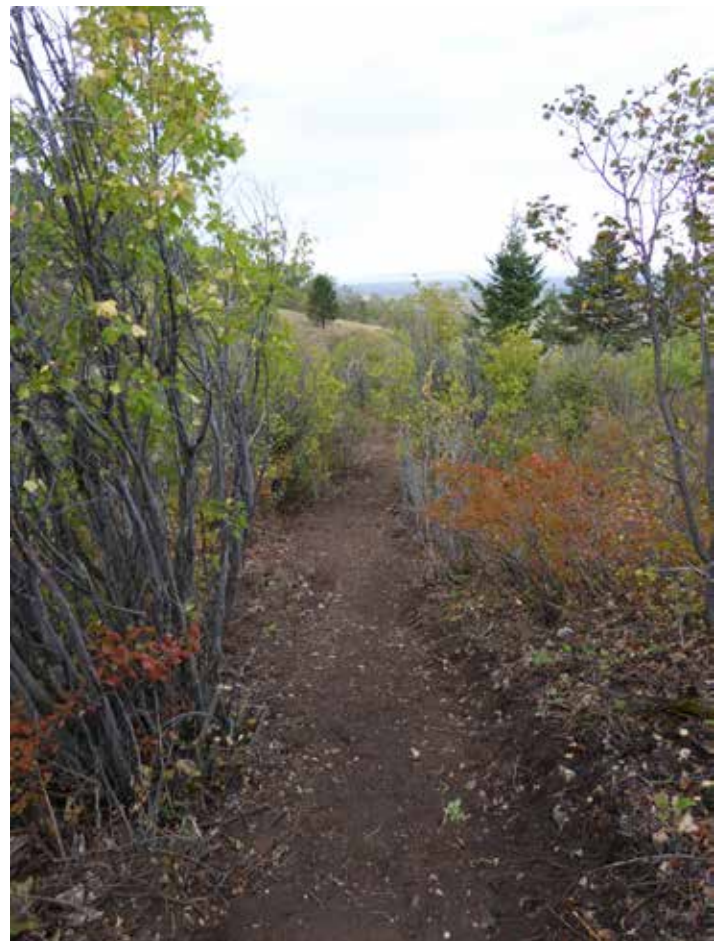
A completed section of trail on September 19 th . The trail’s appearance will improve significantly as understory plants fill-in and native re-seeding takes place, which is scheduled for November 2015.

SCLT’s staff and board of directors would like to thank all of our members who make projects like this one possible, as well as all of the individuals and organizations in our community who have supported our work. If you have any questions or concerns regarding the project, our door is always open and there will be ample opportunities for public comments in the coming months and years.