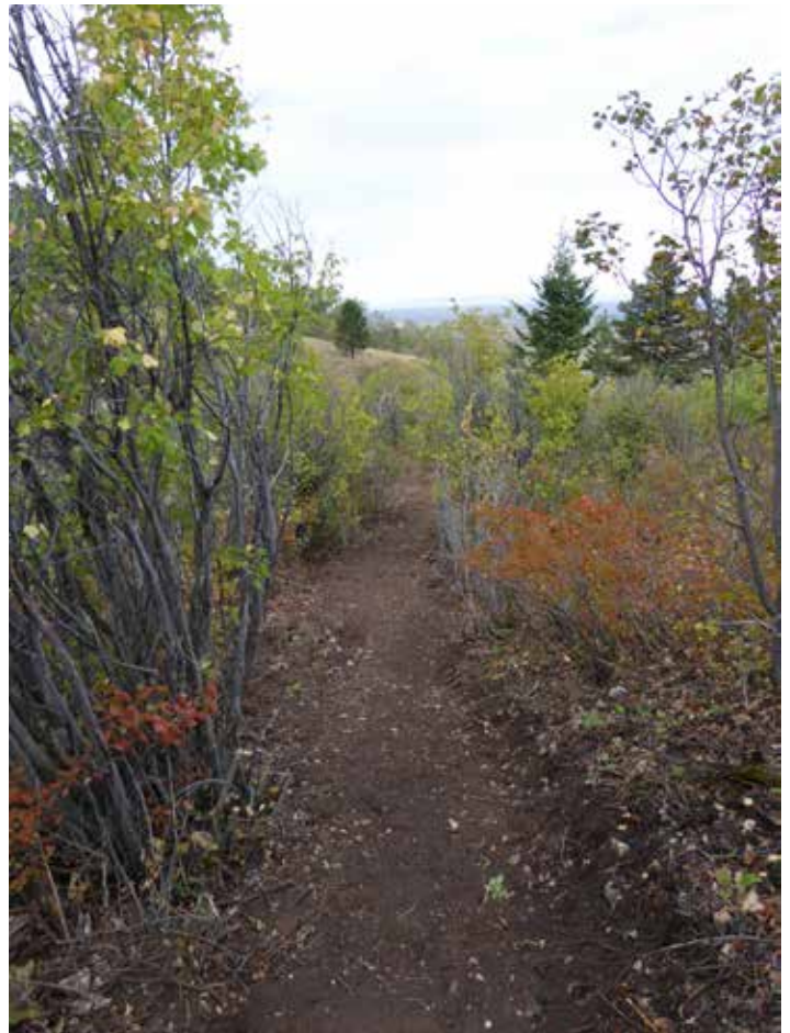
A completed section of trail on September 19 th . The trail’s appearance will improve significantly as understory plants fill-in and native re-seeding takes place, which is scheduled for November 2015.

SCLT’s staff and board of directors would like to thank all of our members who make projects like this one possible, as well as all of the individuals and organizations in our community who have supported our work. If you have any questions or concerns regarding the project, our door is always open and there will be ample opportunities for public comments in the coming months and years.