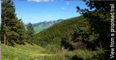
View from a proposed trail.