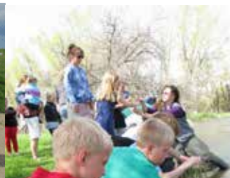
View from a proposed trail.