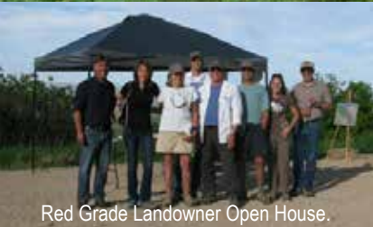
Red Grade Landowner Open House.