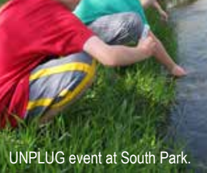
UNPLUG event at South Park.