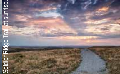
Soldier Ridge Trail at sunrise.