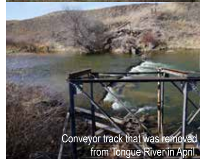
Conveyor track that was removed from Tongue River in April.