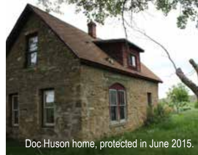
Doc Huson home, protected in June 2015.