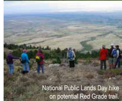
National Public Lands Day hike on potential Red Grade trail.