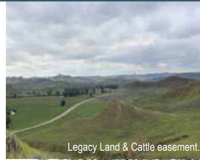
Legacy Land & Cattle easement.