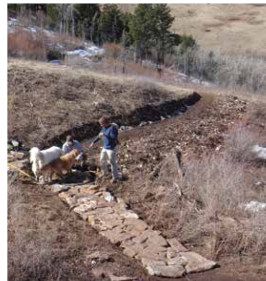
Volunteers “armoring” the trail

In February, SCLT received six bids for reconstruction work on existing parking areas located on State lands along Red Grade Road and selected the qualified low bid from GW Construction of Gillette. Work is expected to commence in May and be completed by July. Reconstruction of the parking areas will benefit all types of recreationists who access public lands from Red Grade Road. While the sizes of the reconstructed parking areas will see only modest increases related to attaining proper parking grades, the resulting parking arrangement, ingress/egress, and overall traffic flow will improve greatly. SCLT continues to fundraise the final 10% of costs for this project, estimated at $220,000. Please be in touch if you would like to support this community project and help us meet our goal.