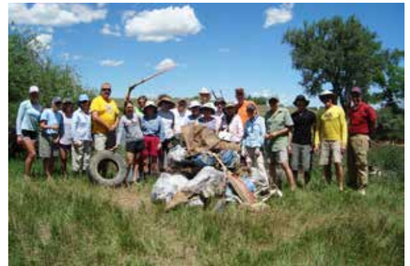
2015 Tongue Riverpalooza participants with their finds!

As part of the National River Cleanup and back by popular demand, SCLT is hosting our 2nd Annual Tongue Riverpalooza! If you're looking to escape the heat of rodeo, try dipping a paddle in the river as we float downstream picking up refuse... it doesn't get better than this! Last year's best finds included a light saber and a vacuum cleaner...who knows what your boat may discover this season?! To sign up email katie@sheridanclt.org .