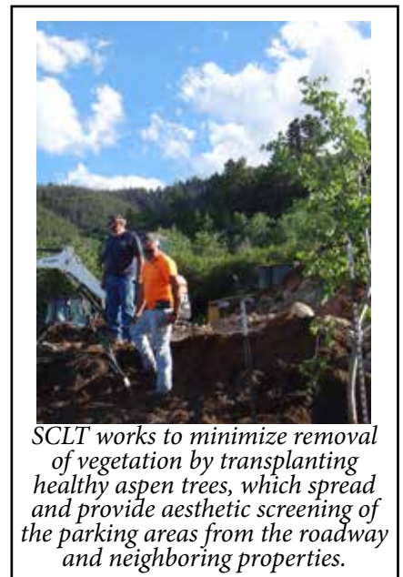
SCLT works to minimize removal of vegetation by transplanting healthy aspen trees, which spread and provide aesthetic screening of the parking areas from the roadway and neighboring properties.

Special thanks to Garber Agribusiness, Malone Belton Abel Architects and GW Construction for in-kind donations; and to our on-site volunteers for many hours of design vetting, vegetation care and reseeded work.