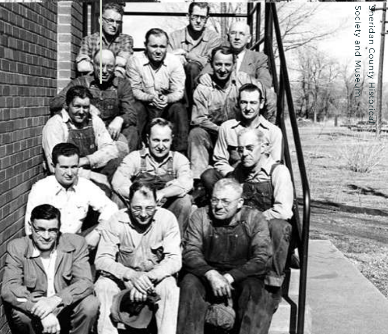
Sheridan County Historical Society and Museum