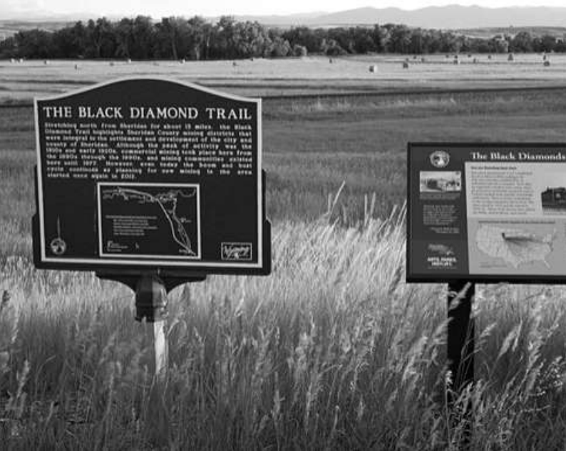
Sheridan County Historical Society and Museum