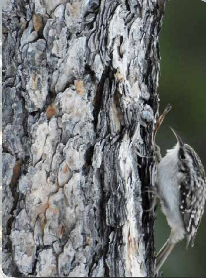
Brown Creeper Trepadorcito Americano

Try to find me! I tend to live on mature trees.