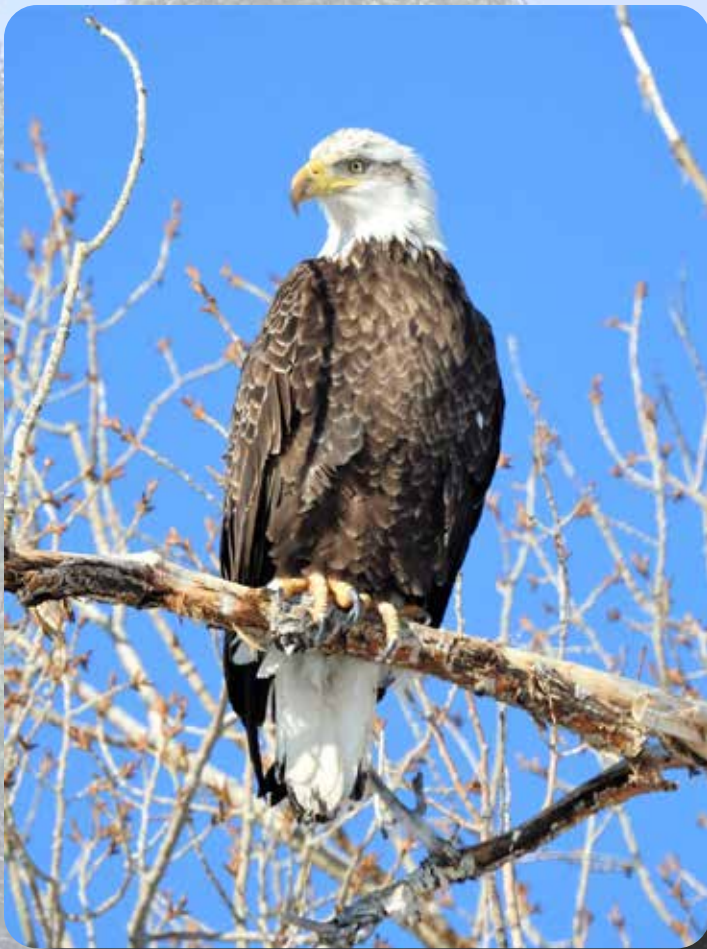
Bald Eagle Agulia Cabeza Blanca