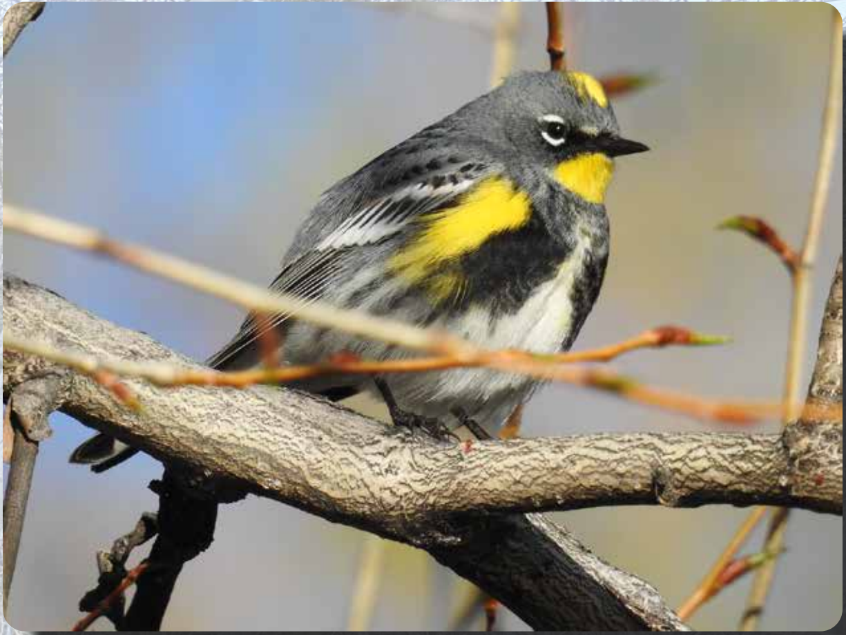
Yellow-rumped Warbler Chipe Rabadilla Amarilla