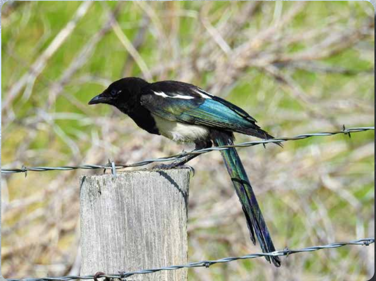
Black-billed Magpie Urraca De Hudson