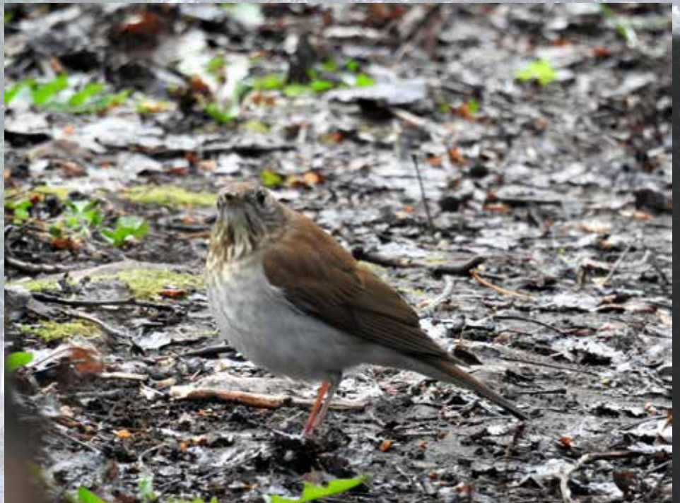
Veery Zorzal Canelo

I live in shady woods with leafy understory.