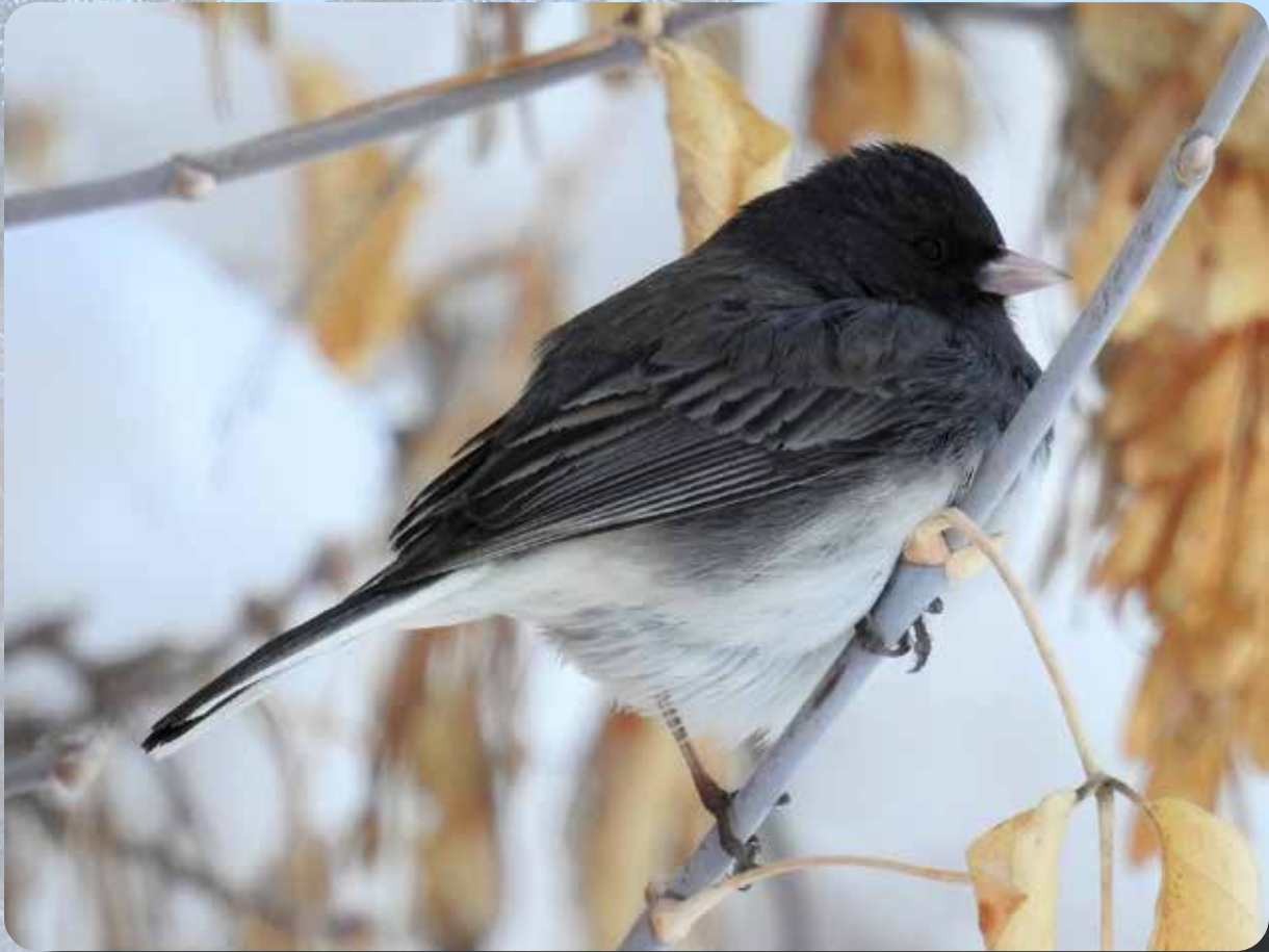
Darked-eye junco Juncos Ojos Negros