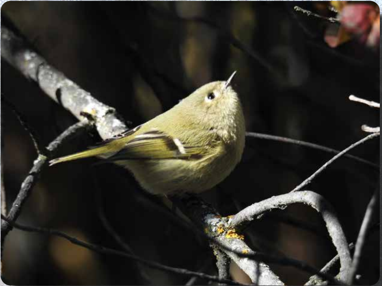
Ruby-Crowned Kinglet Reyezuelo Matraquita