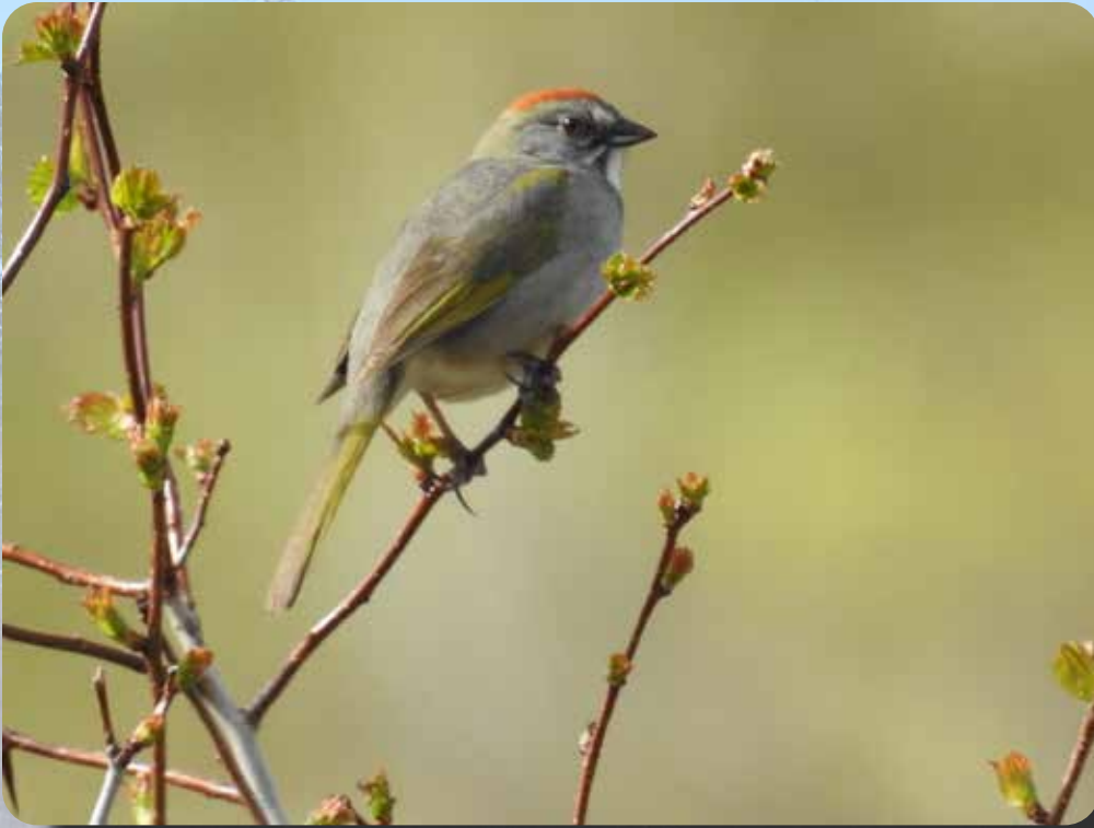
Green-tailed Towhee Rascador Cola Verde