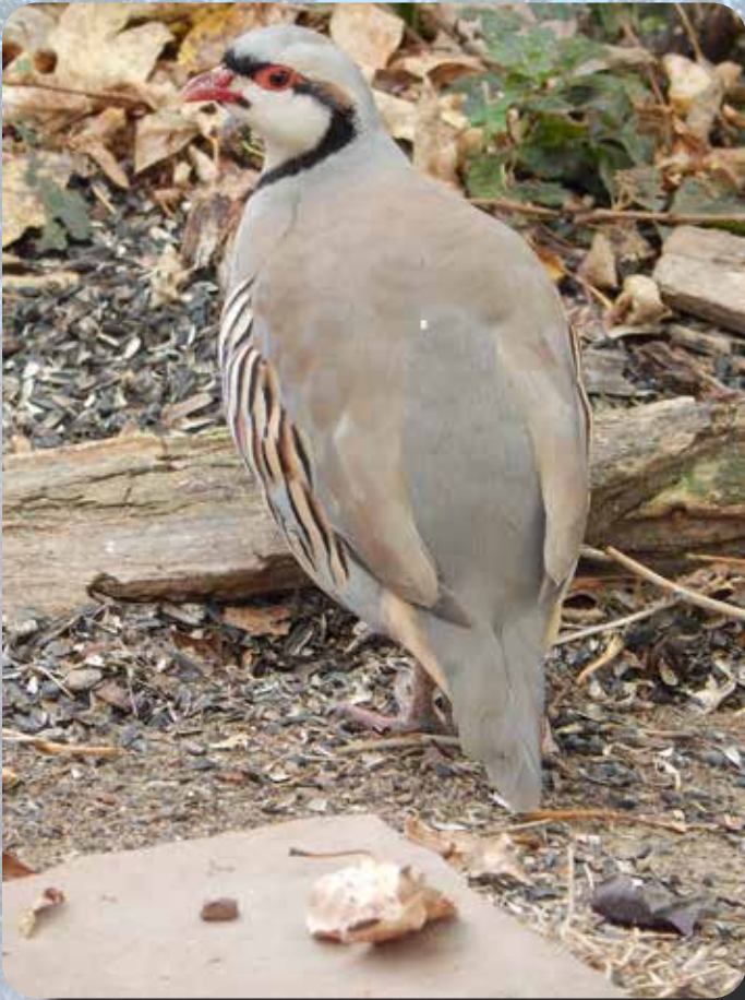
Chukar Partridge Perdiz Chucar