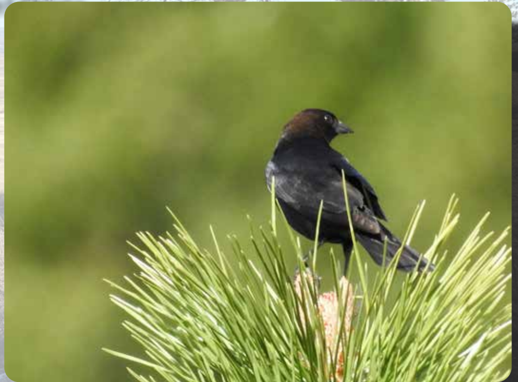
Brown-headed Cowbird Tordo Cabeza Café