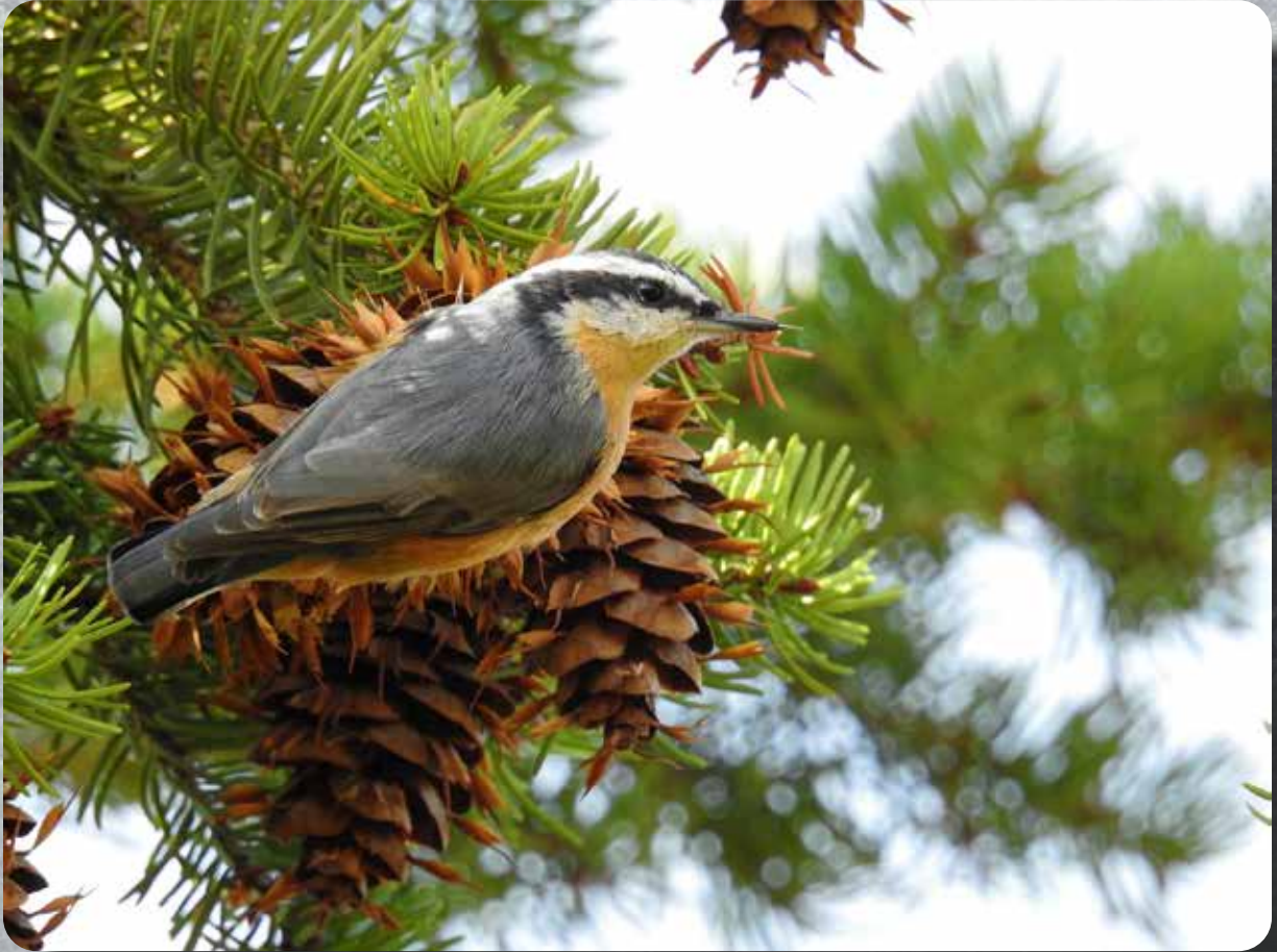
Red Breasted Nuthatch Bajapalos Pecho Canela