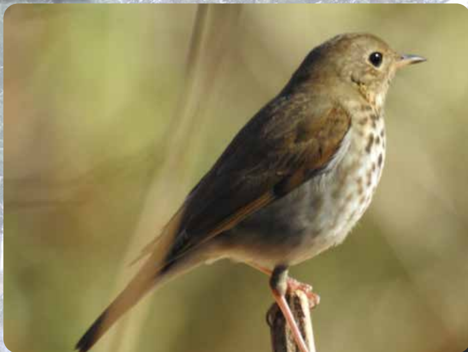
Hermit Thrush Zorzal Cola Canela