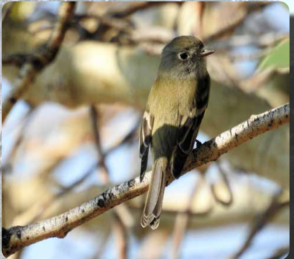
Hammond's Flycatcher Papamoscas de Hammond