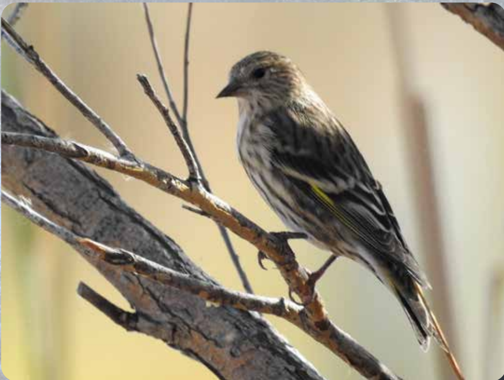
Pine Siskin Jilguerito Pinero