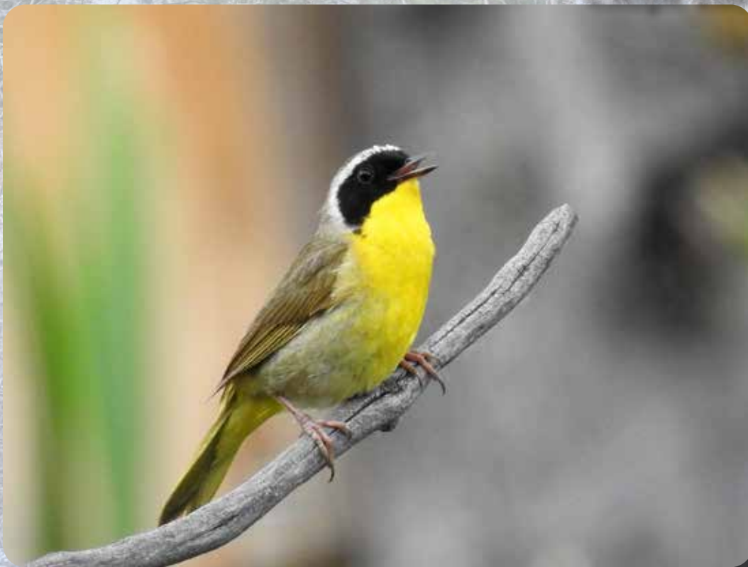
Common Yellowthroat Mascarita Común