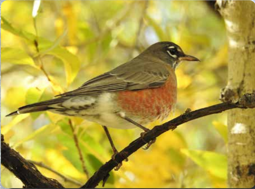
American Robin Mirlo Primavera