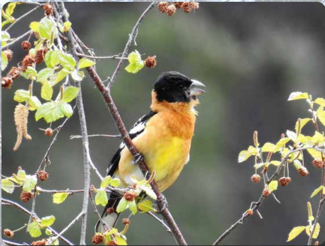
Black-headed Grosbeak Picogordo Tigrillo