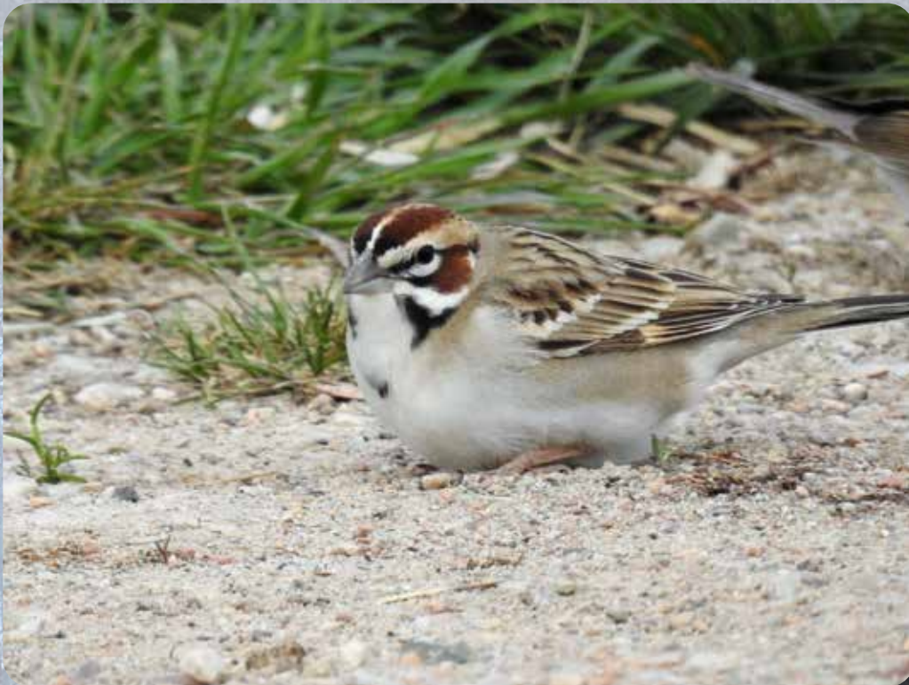
Lark Sparrow Gorrion Arlequin