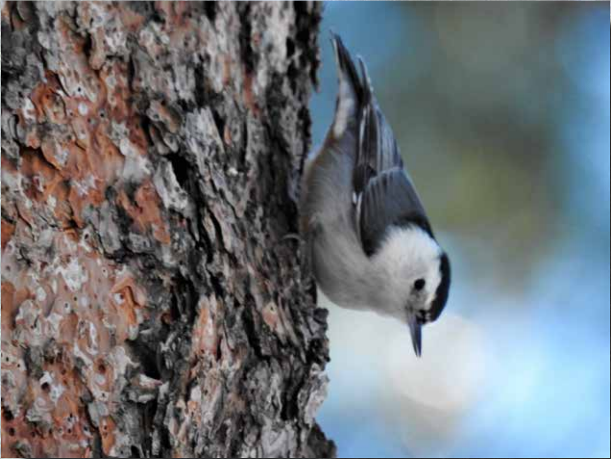
White Breasted Nuthatch Bajapalos Pecho Blanco