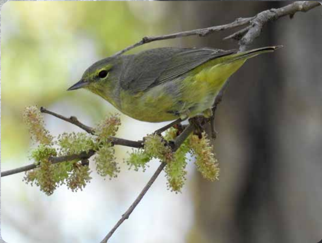
Orange-crowned warbler Chipe Oliváceo