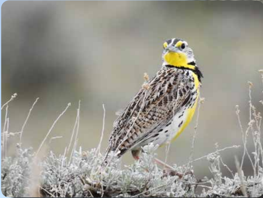
Western Meadowlark Pradero del Oeste