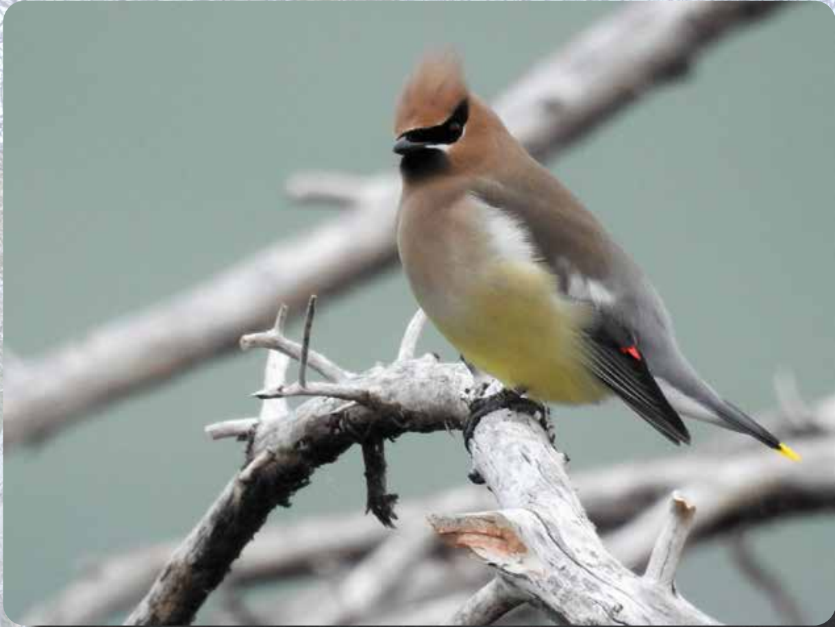
Cedar Waxwing Chinito