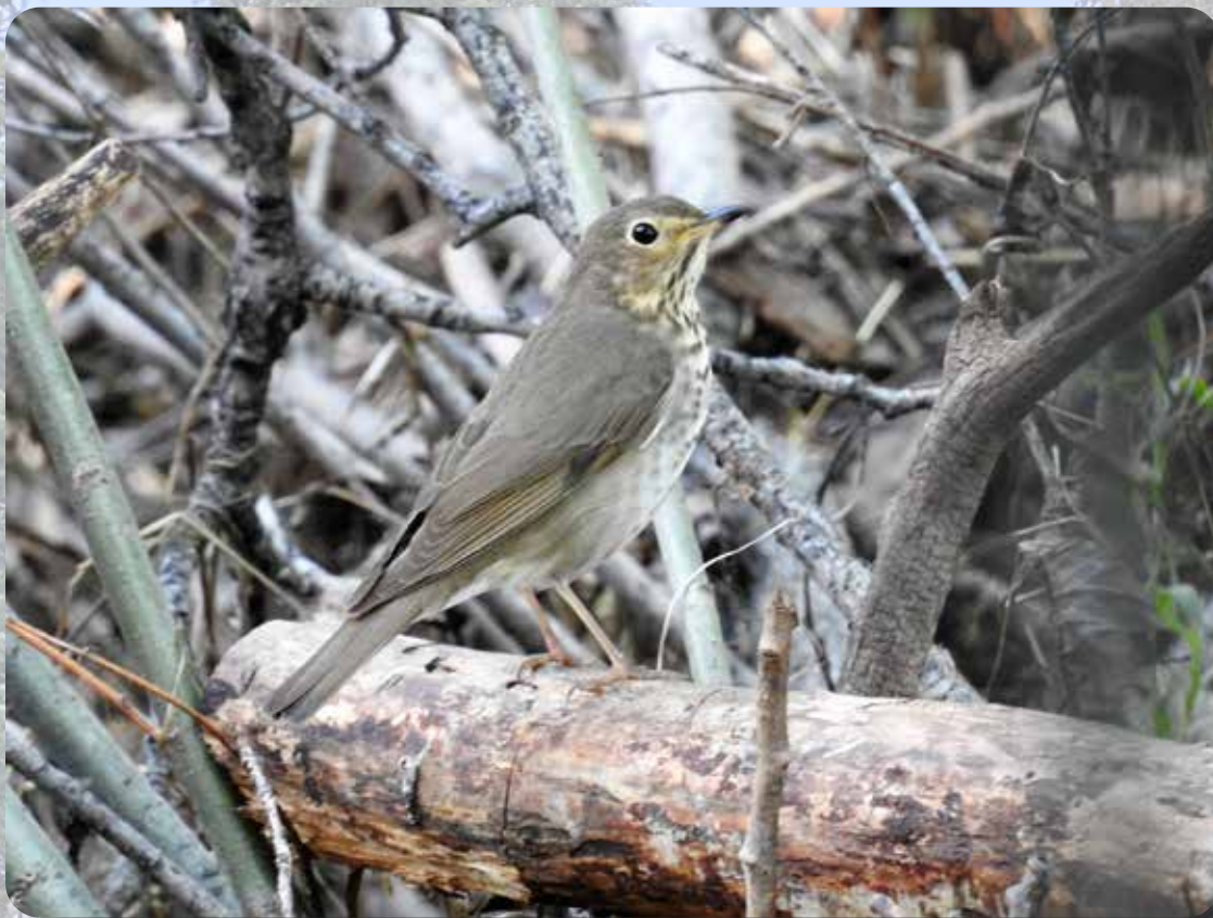
Swainsons Thrush Zorzal de Anteojos