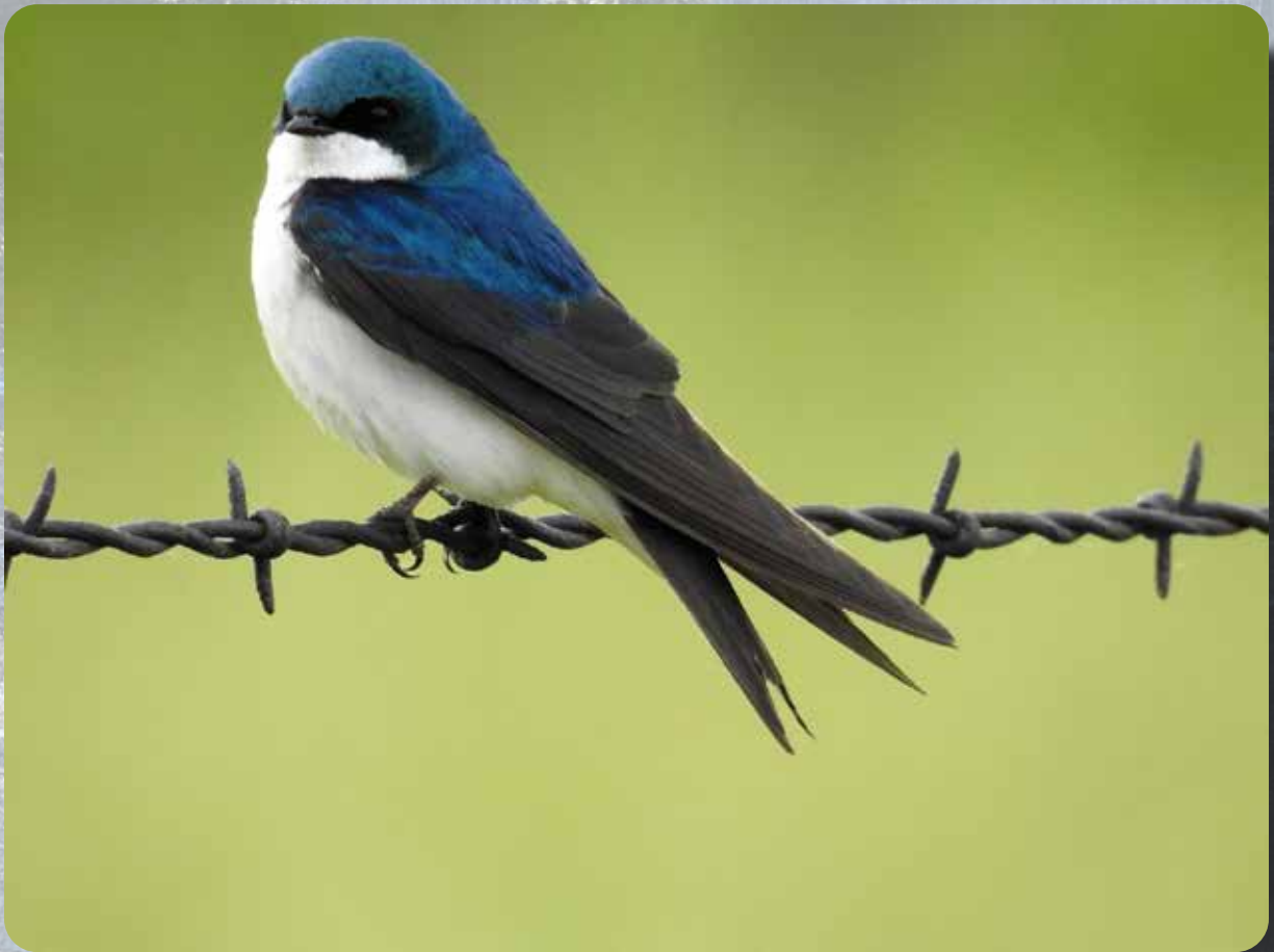
Tree Swallow Golondrina Bicolor

My Song: twit-weet twit- weet twit-weet liliweet twit-weet