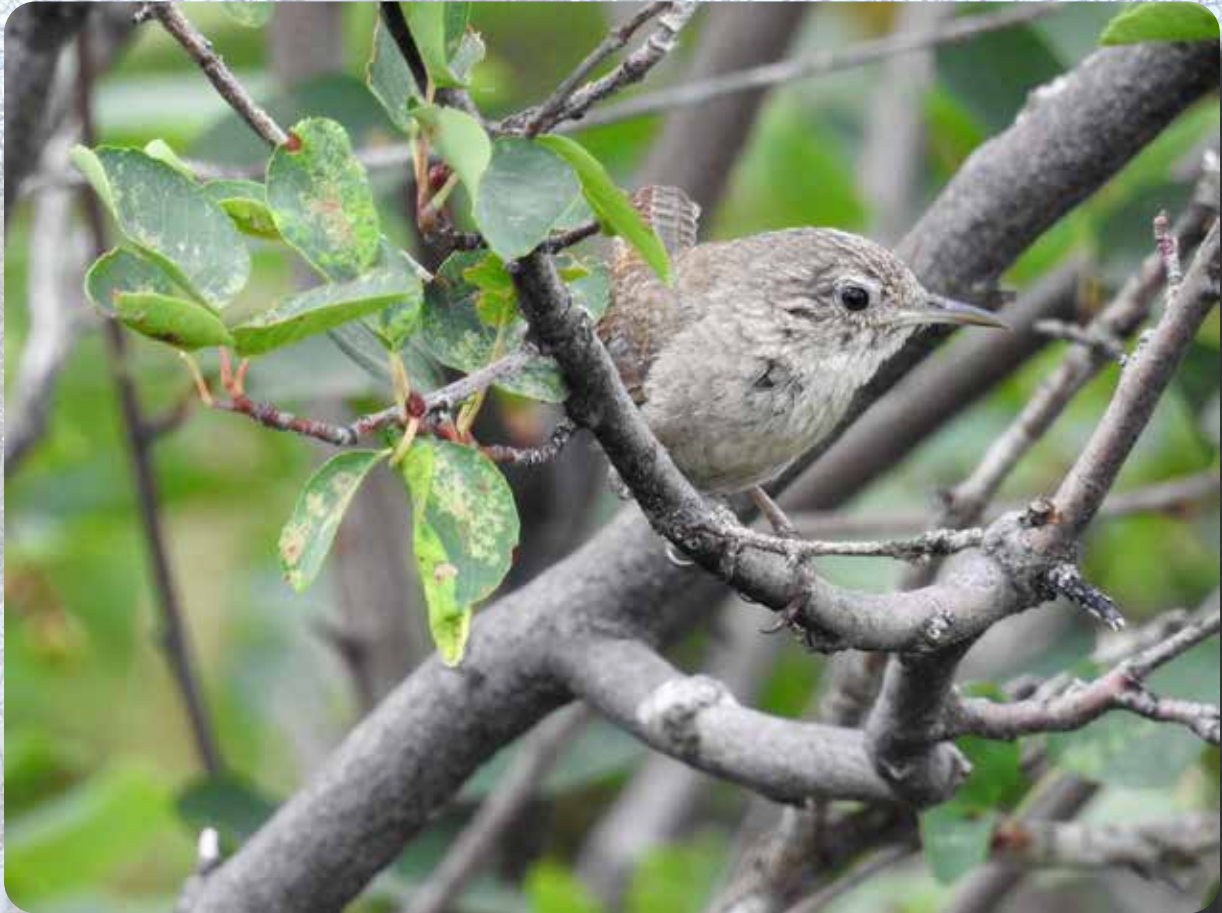
House wren Saltapared Común

I'm pretty secretive but you'll hear me loudest in the summer.