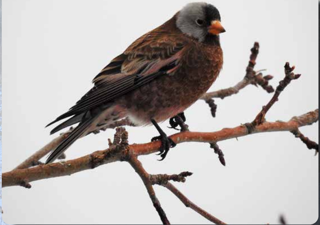
Gray-Crowned Rosy Finch Pinzón Montano Nuquigrís