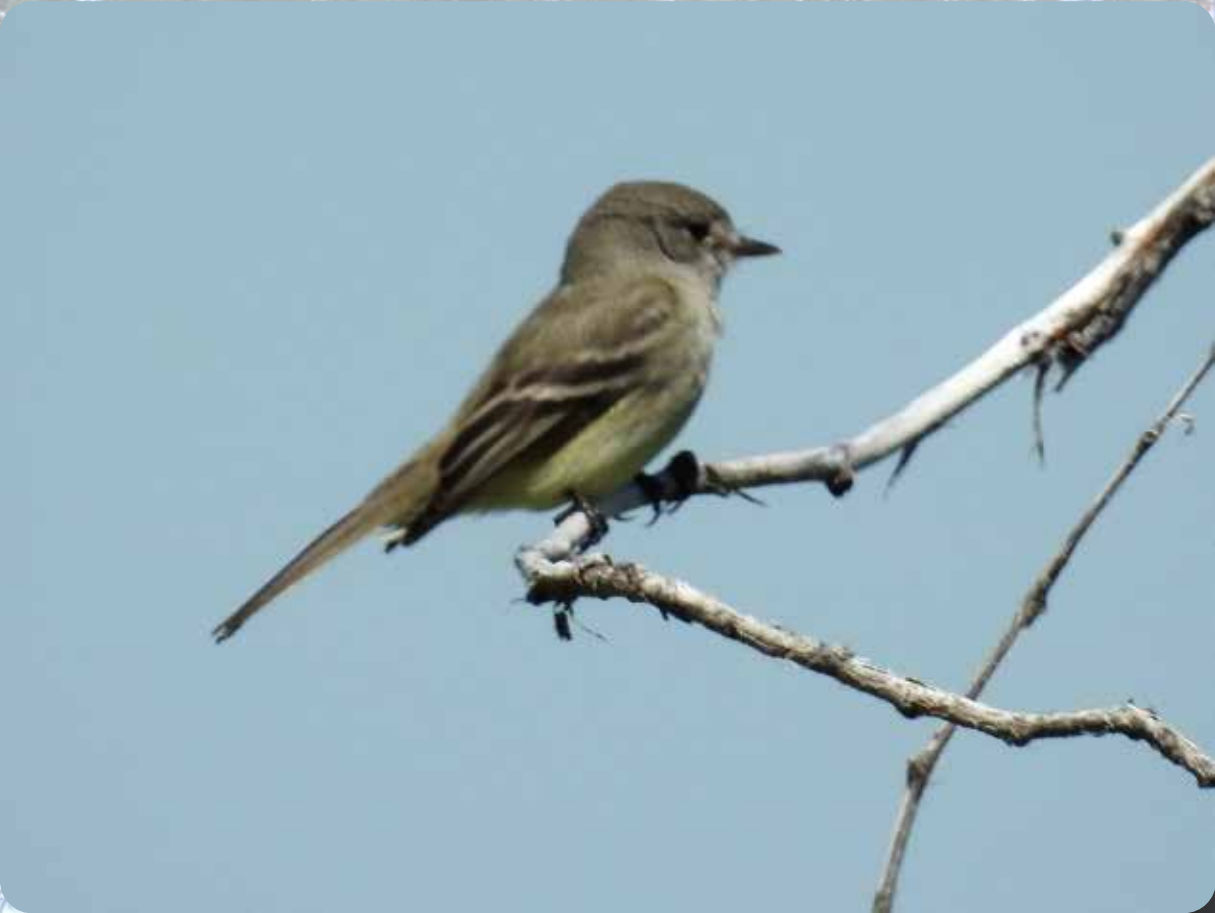
Dusky Flycatcher Papamoscas Matorralero

Try and find me in low chaparral, brush and small trees!