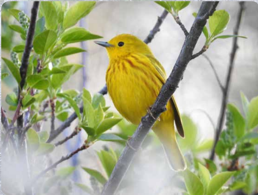
Yellow Warbler Chipe Amarillo