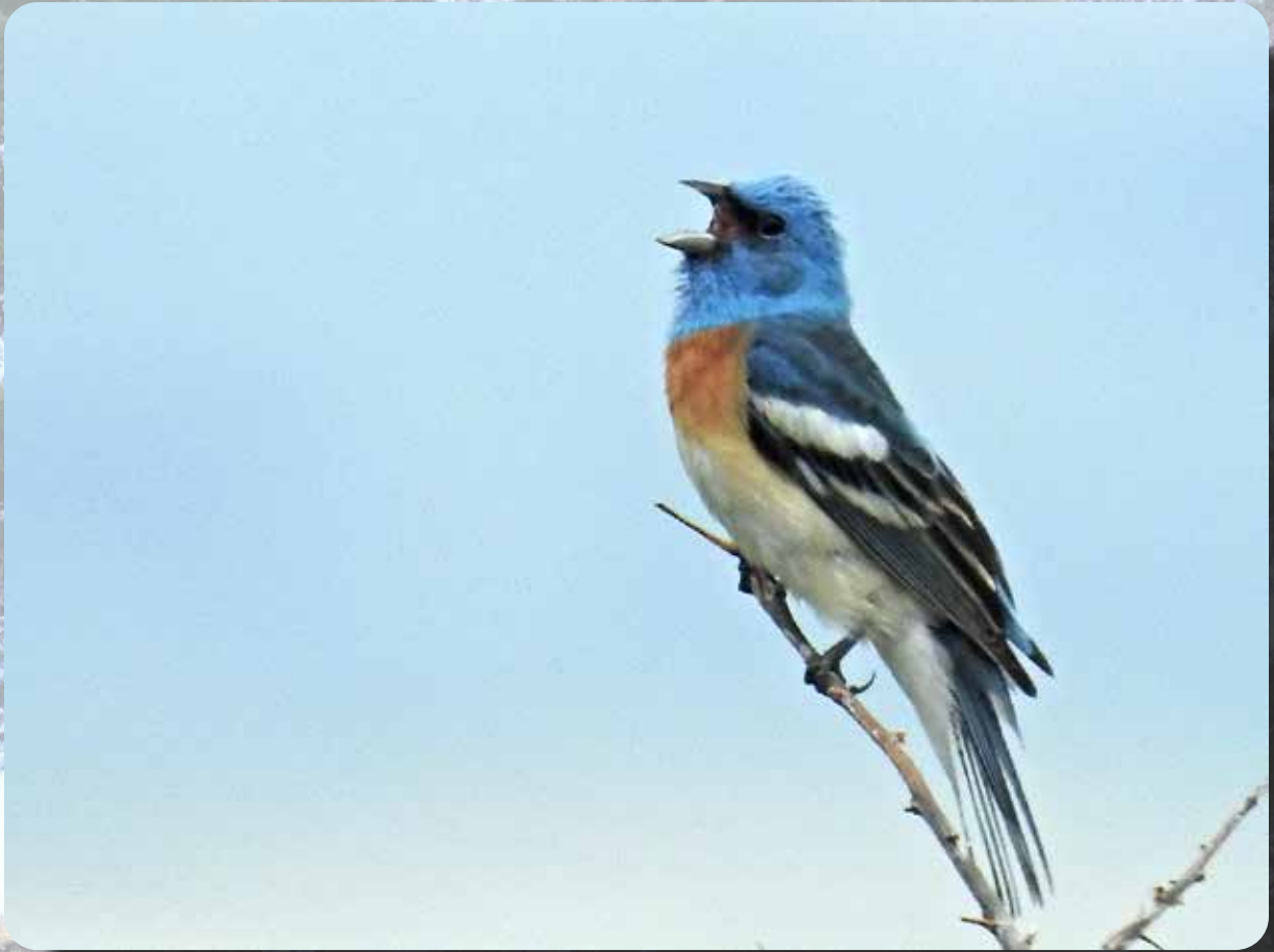
Lazuli Bunting Colorín Pecho Canela