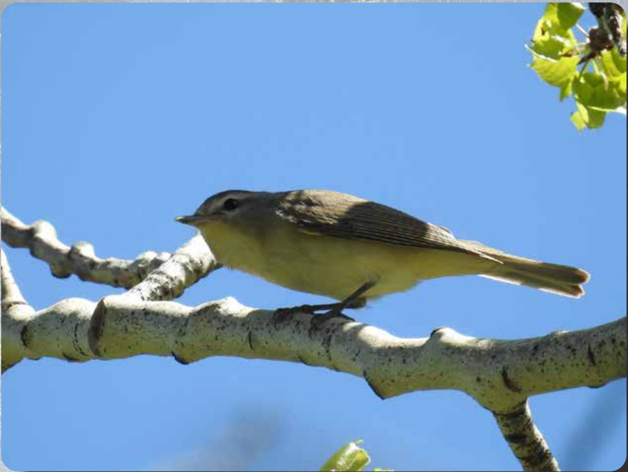
Warbling Vireo Vireo Gorjeador