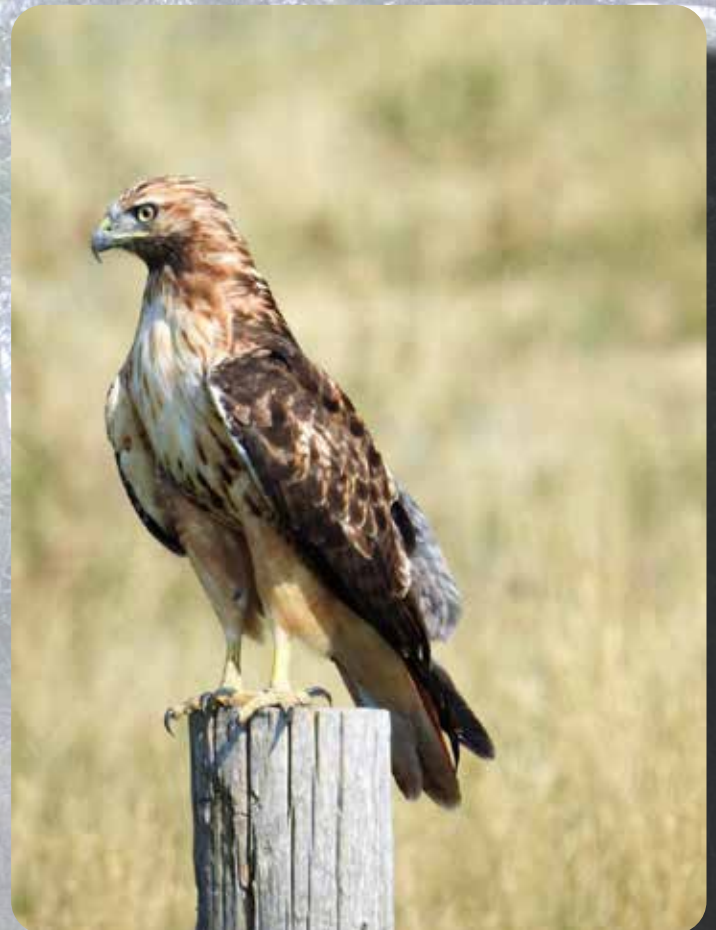
Red-tailed Hawk Aguililla Cola Roja