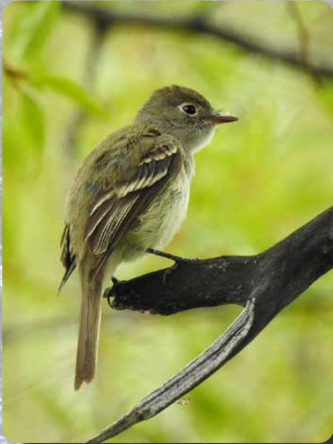
Least Flycatcher Papamoscas Chico