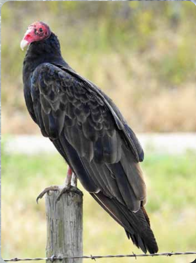
Turkey Vulture Zopilote Aura