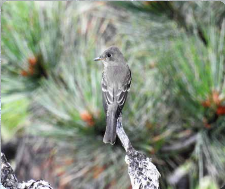
Western Wood-Pewee Papamoscas del Oeste