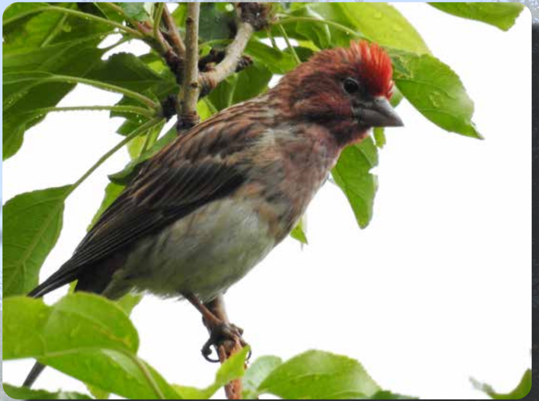
Cassin's Finch Pinzón Serrano