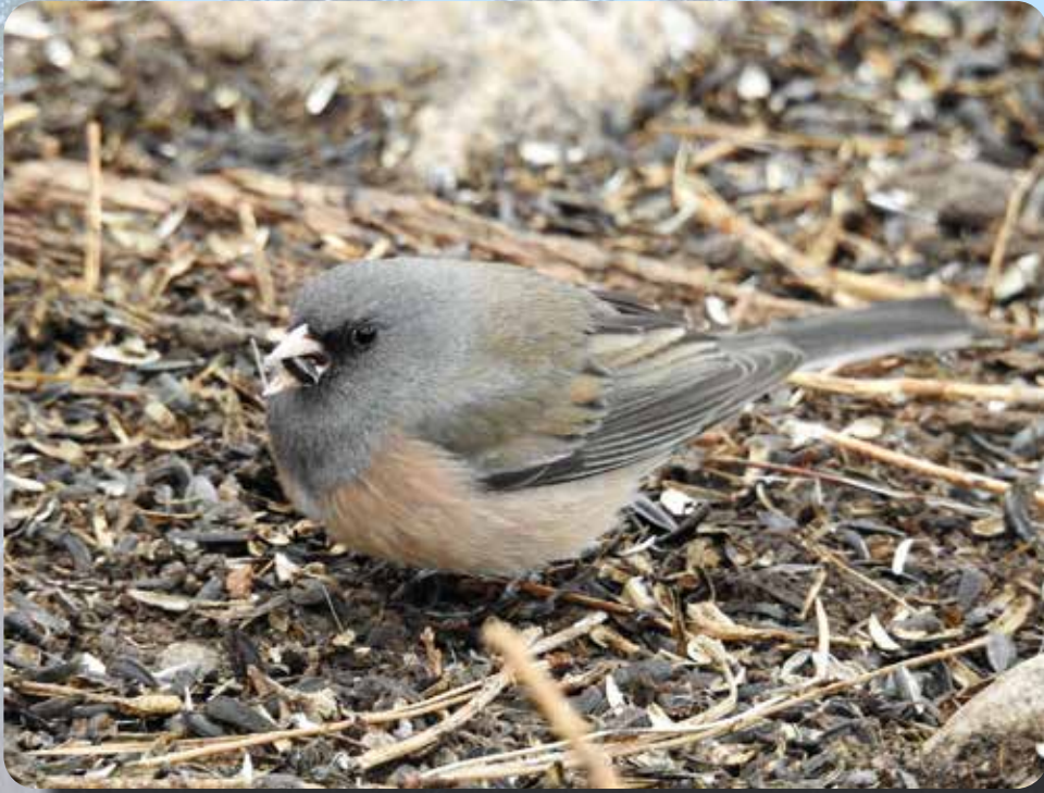
Dark-eyed Junco Juncos Ojos Negros