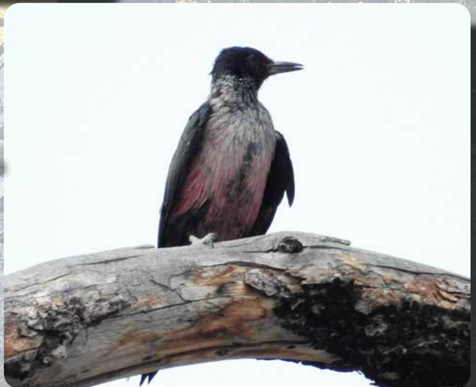
Lewis Woodpecker Carpintero de Lewis