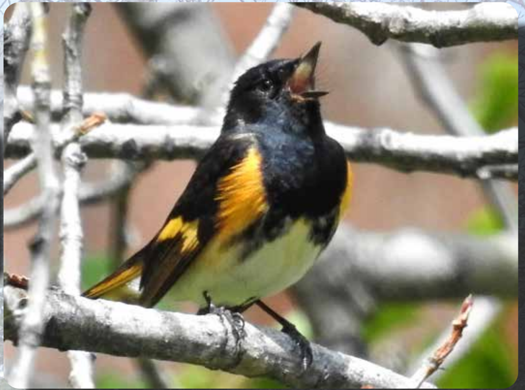
American Redstart Pavito Migratorio

My Song: Tsee Tsee Tsee Tsee tzirrr tseeta tseeta tseeta