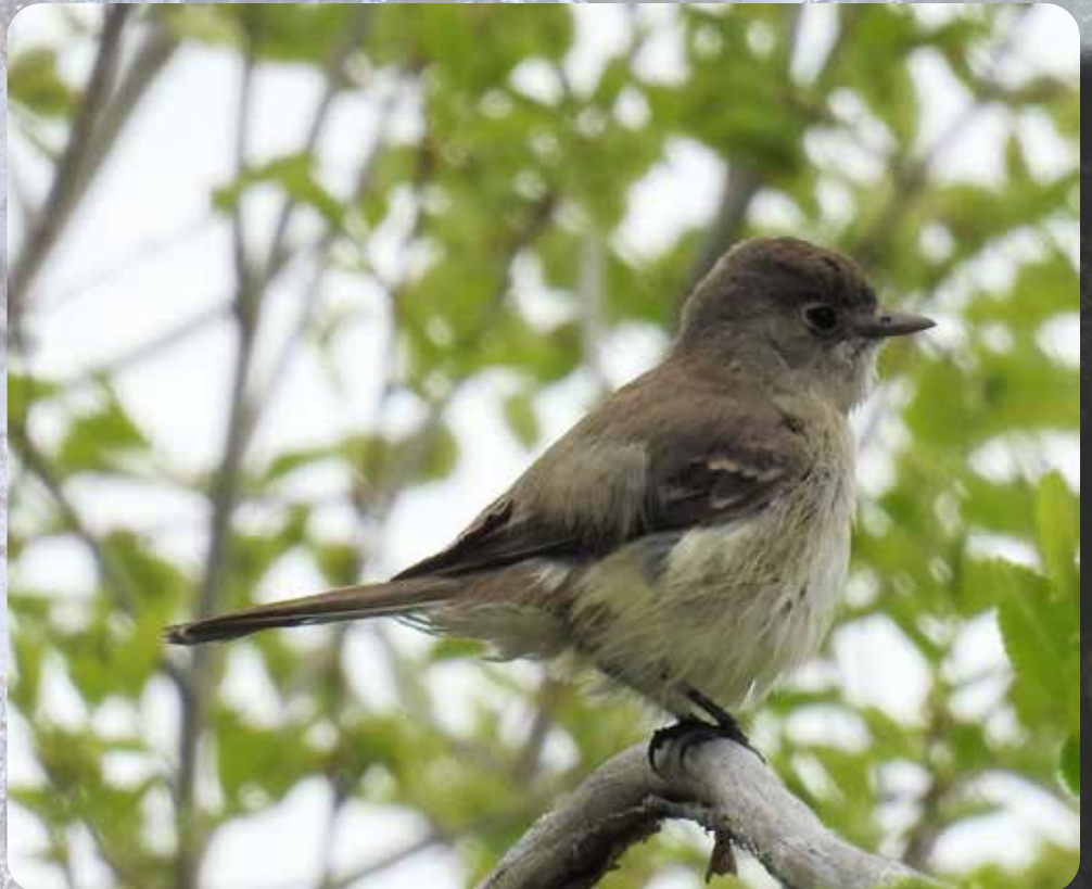
Willow Flycatcher Papamoscas Saucero