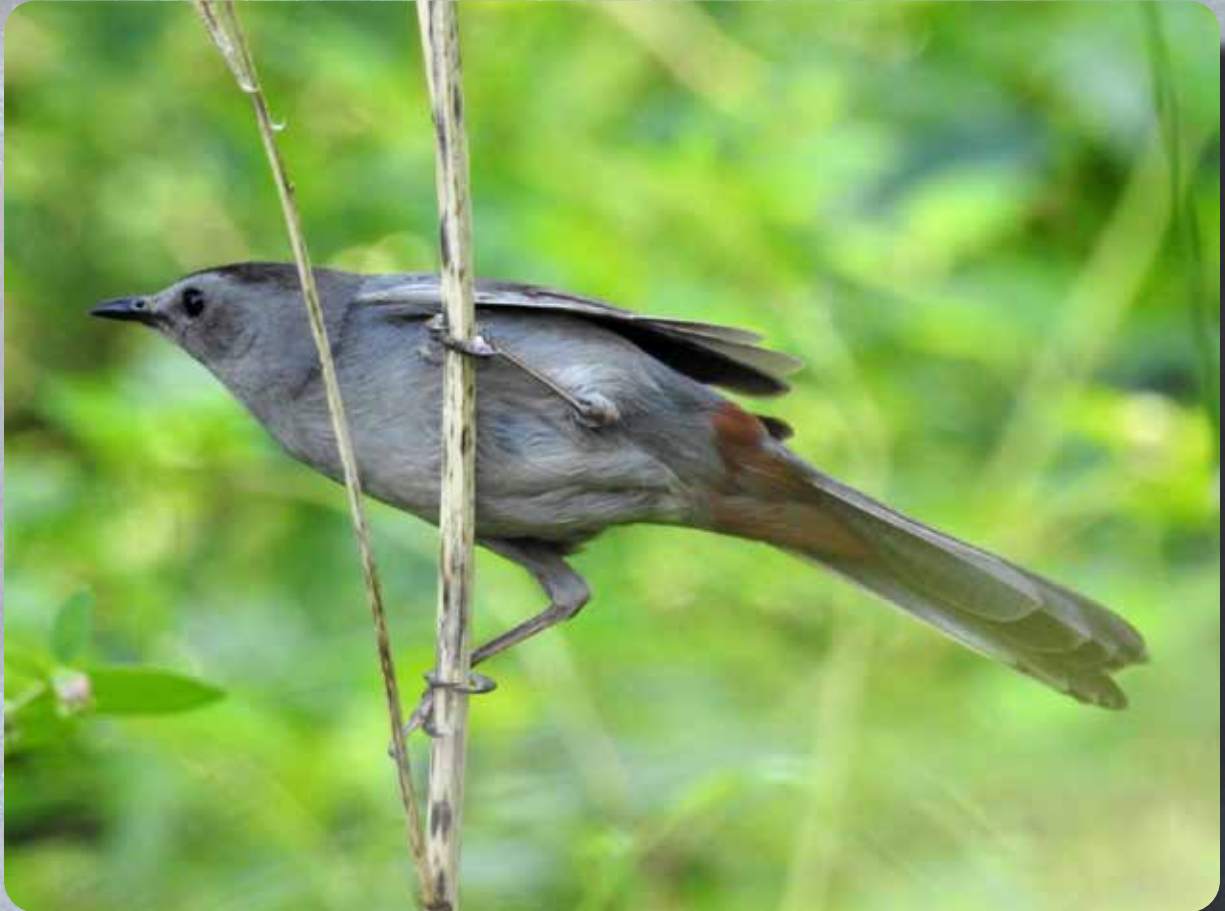
Gray Catbird Maullador Gris