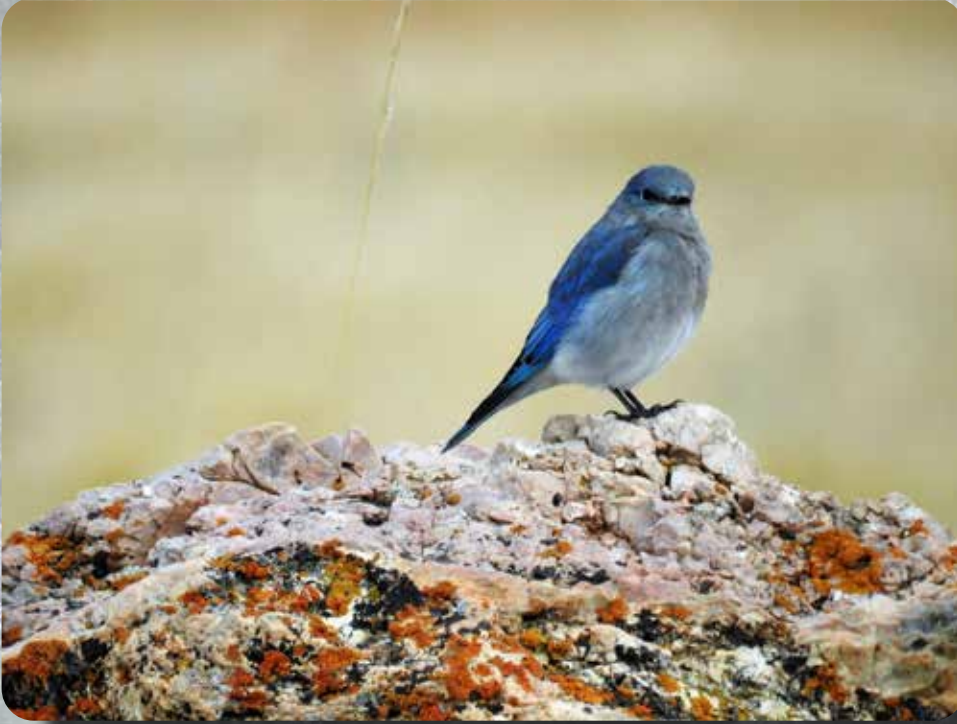
Mountain Bluebird Azulejo Pálido