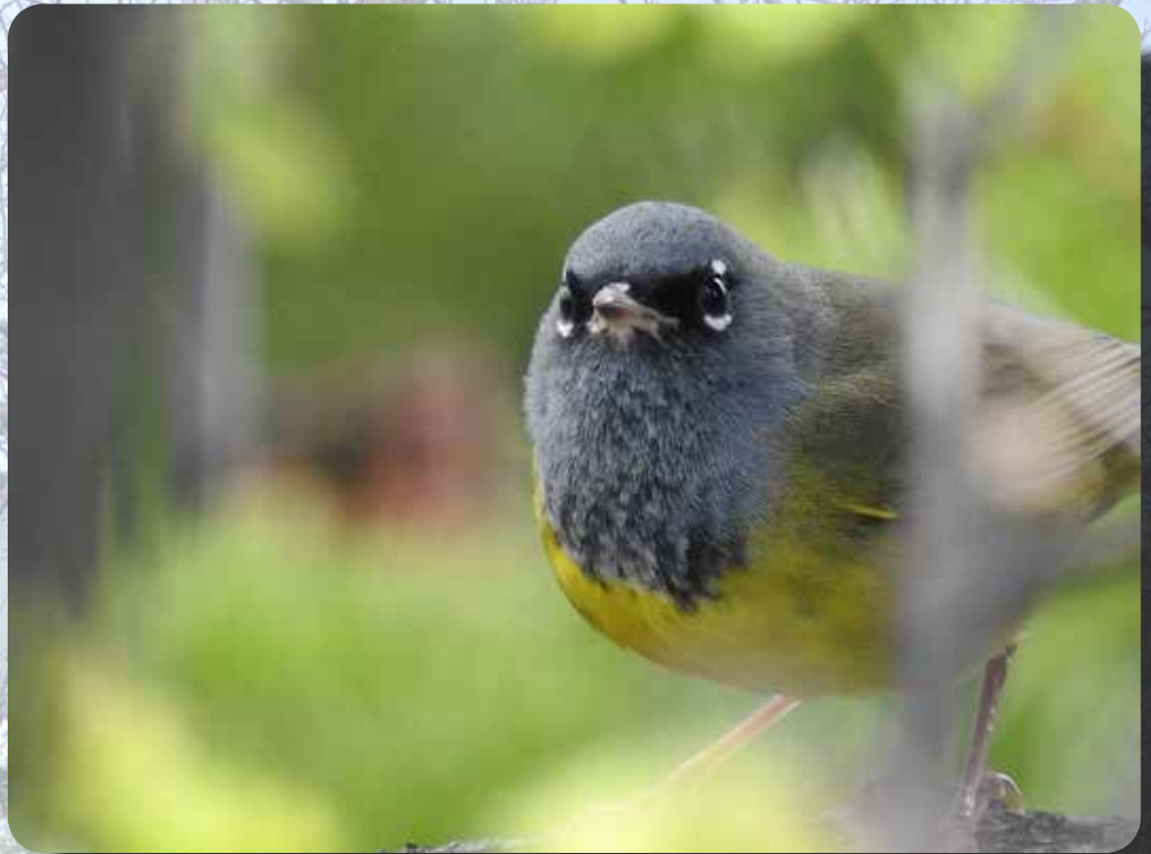
MacGillivray's Warbler Chipe Lores Negros