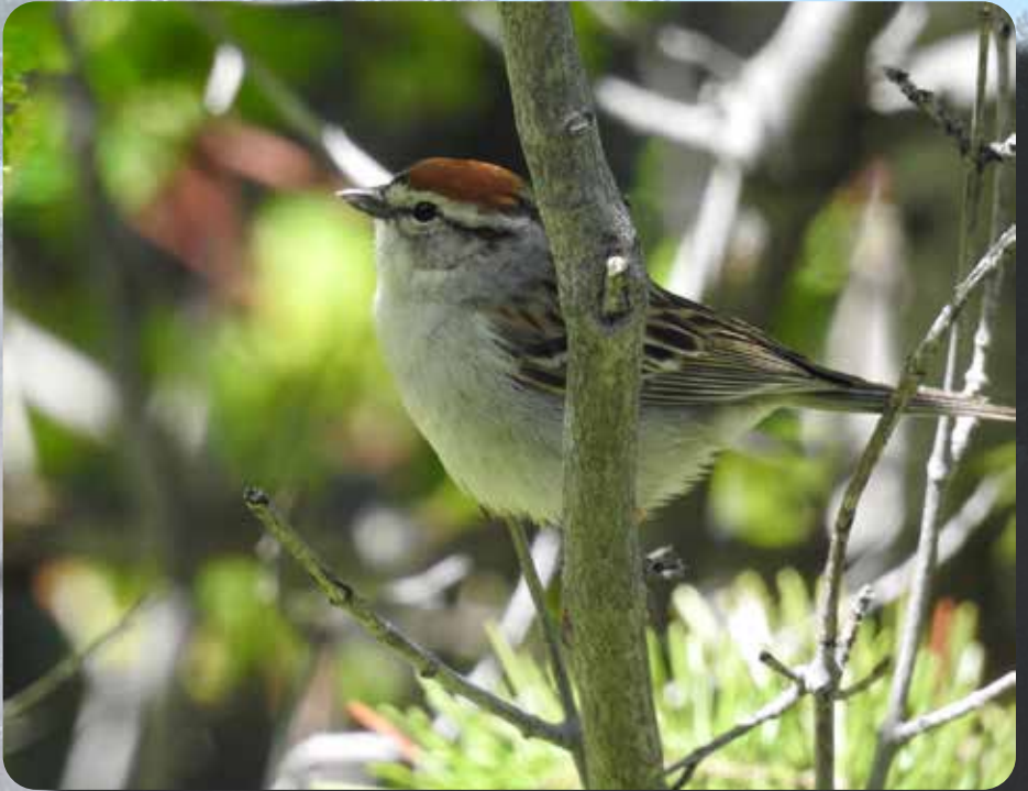
Chipping Sparrow Gorrion Cejas Blancas