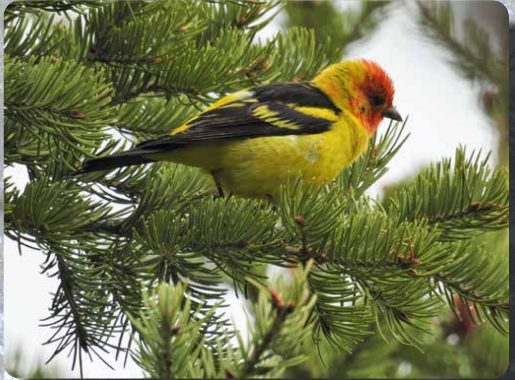
Western Tanager Piranga Capucha Roja