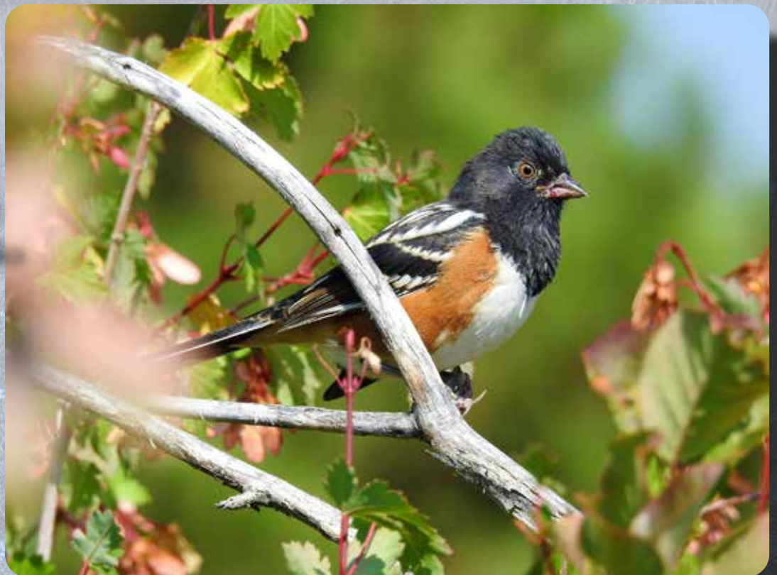
Spotted Towhee Rascador Moteado