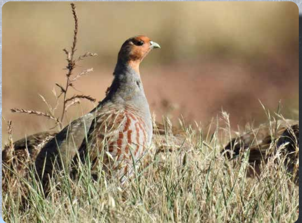
Gray Partridge Perdiz Pardilla