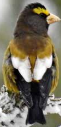
Evening Grosbeak Picogrueso Norteño