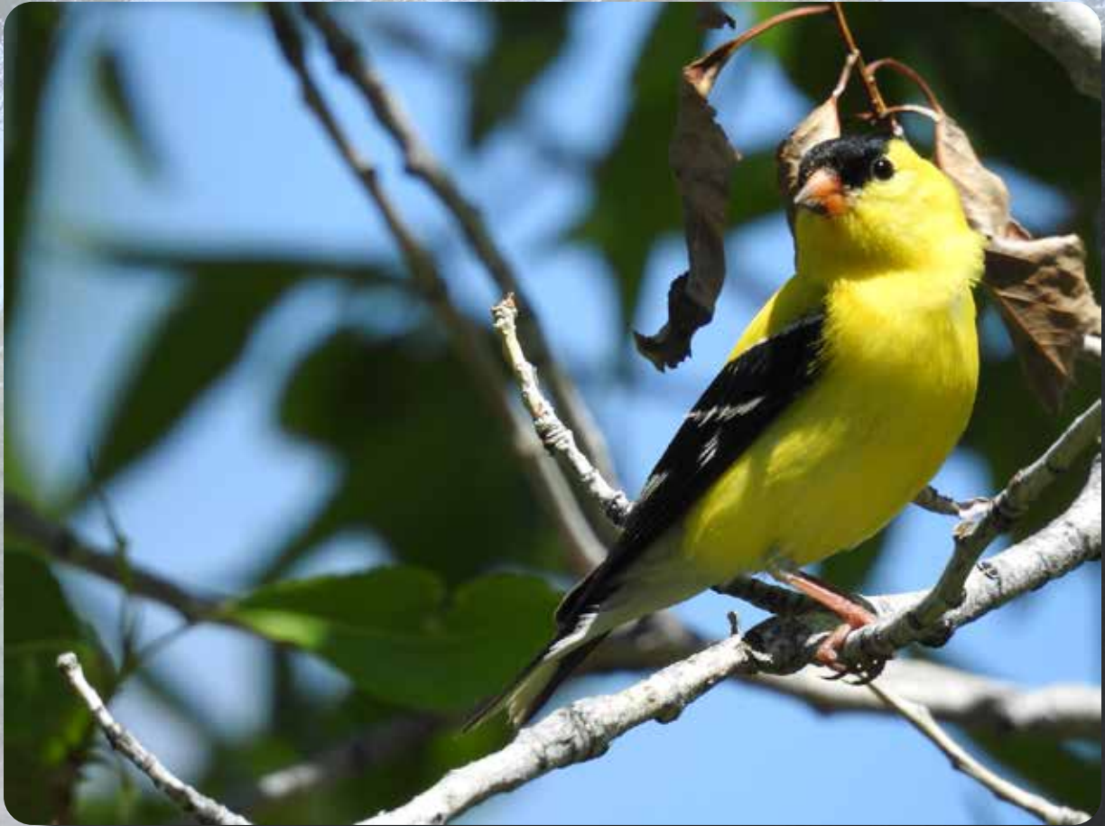
American Goldfinch Jilguerito Canario