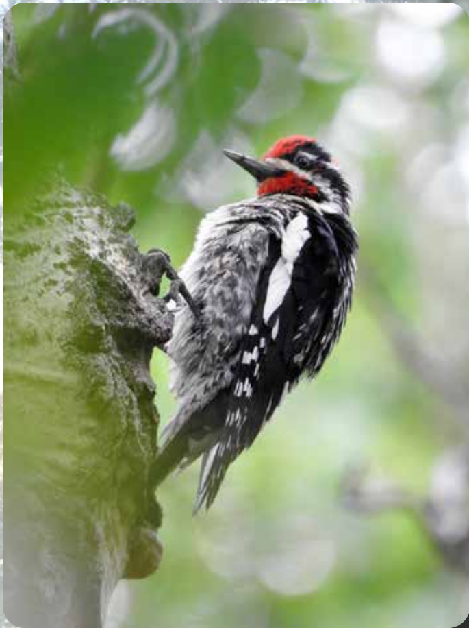
Red-naped Sapsucker Carpintero Nuca Roja