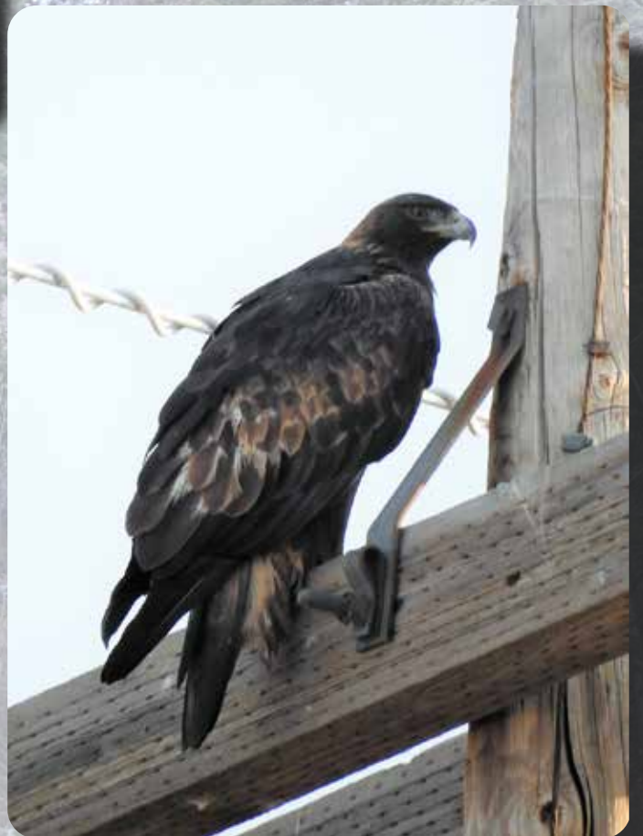
Golden Eagle Águila Real