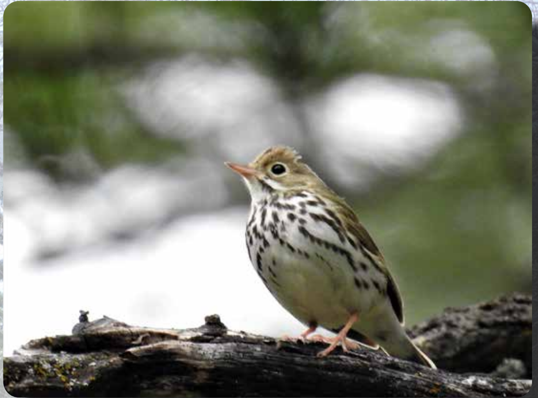
Ovenbird Chipe Suelero