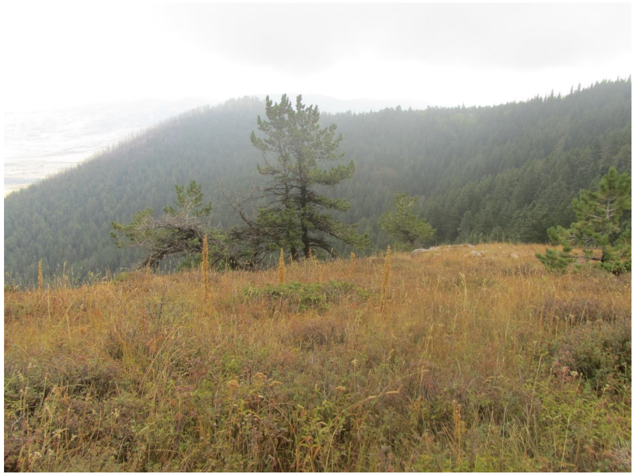
View from an adjacent ridge across to the forested area where the trail will be constructed. The trail will be entirely in forested country and does not traverse the meadow that is the foreground.