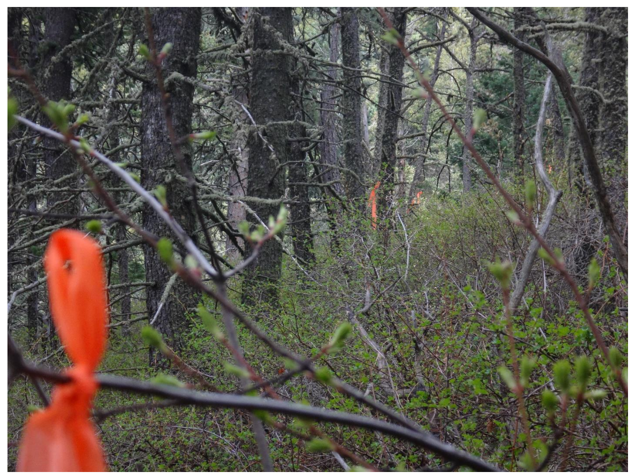
Most of the route travels through larger trees and along a side slope.