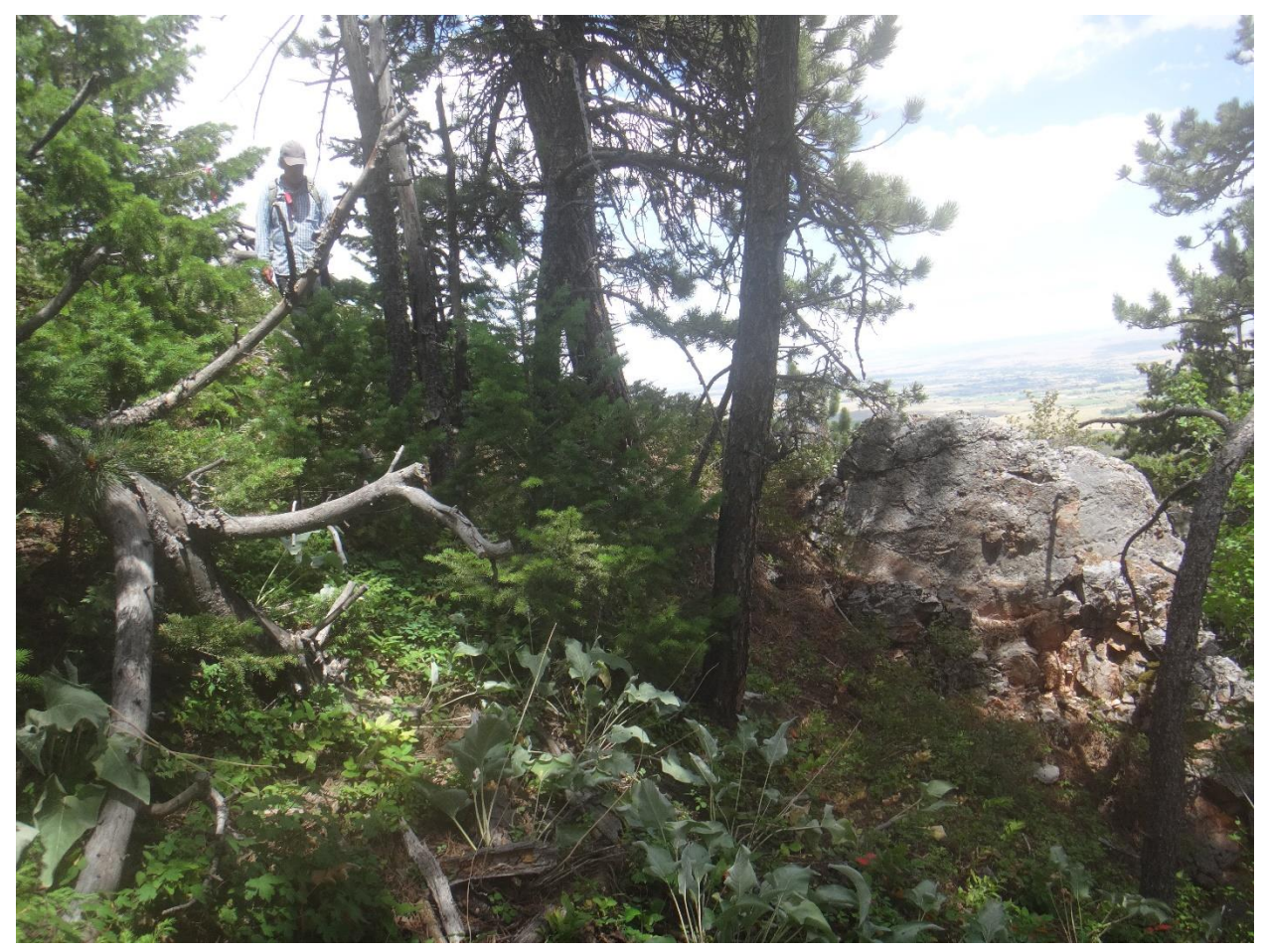
Rock outcroppings are mixed through the route.