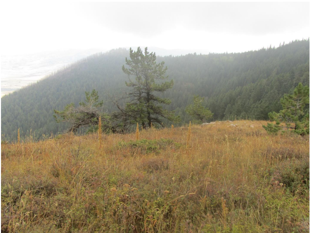
View from an adjacent ridge across to the forested area where the trail will be constructed. The trail will be entirely in forested country and does not traverse the meadow that is the foreground.