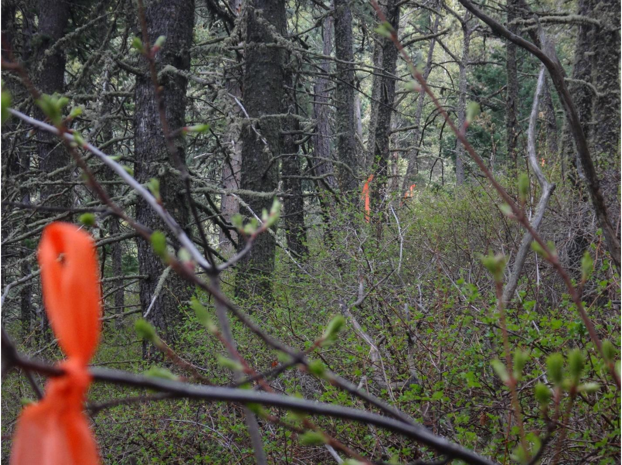
Most of the route travels through larger trees and along a side slope.