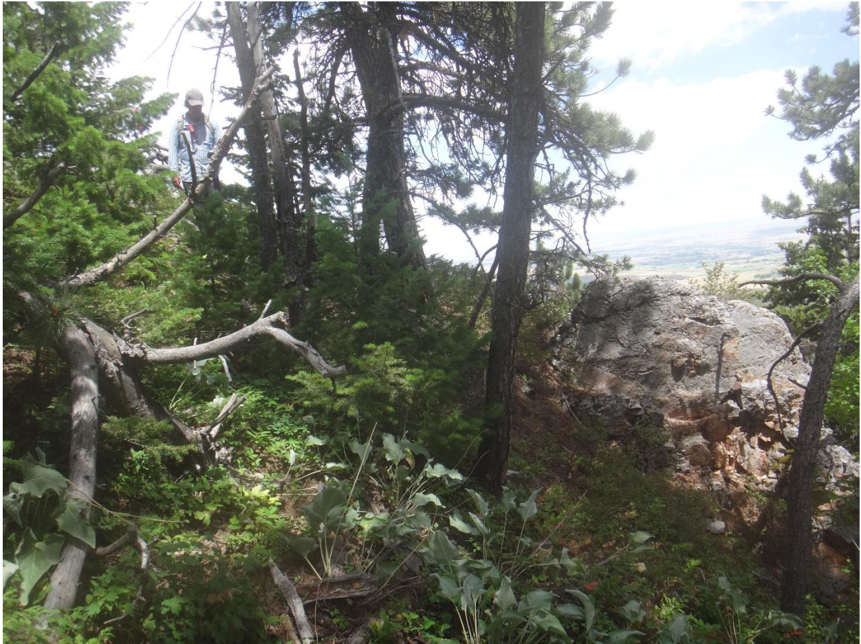
Rock outcroppings are mixed through the route.