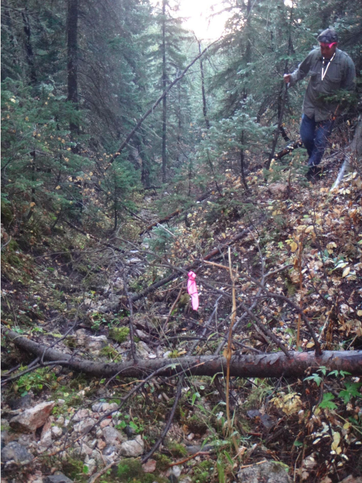
Several drainages will be traversed.