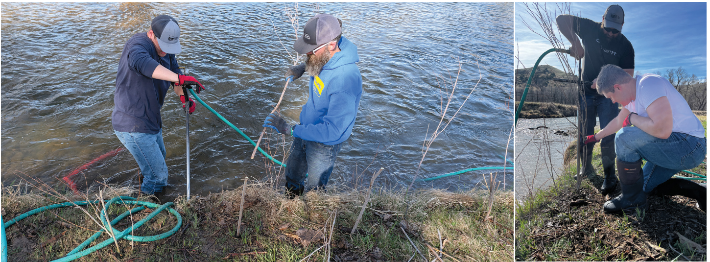
In April, SCLT staff planted willow cuttings at priority sections of Big Goose Creek. It is part of a larger, long-term stream restoration project to stabilize banks, reduce erosion and flood impacts, and improve habitat and access.